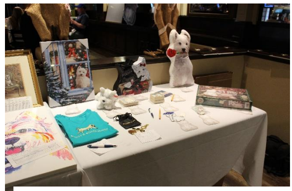
Silent Auction Table