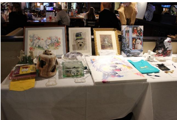
Live Auction Table