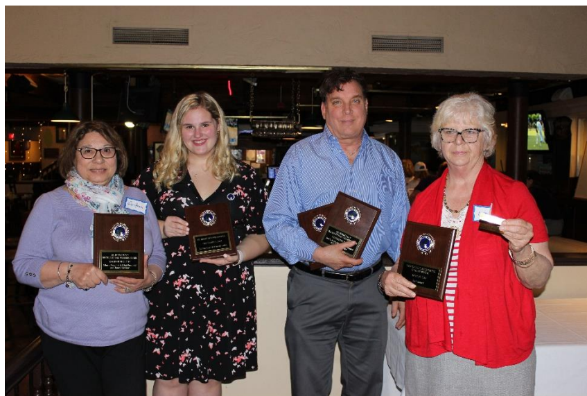
Proud 2018 Title Earners