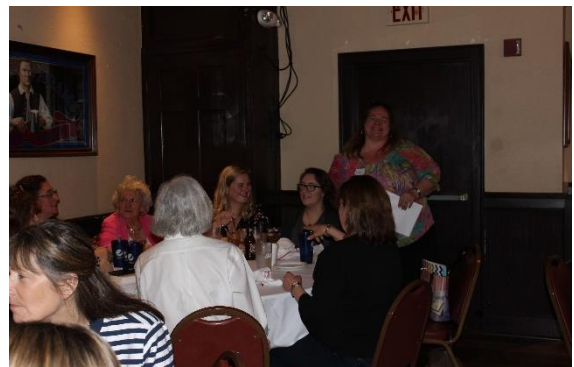
Members catching up with Westie stories.