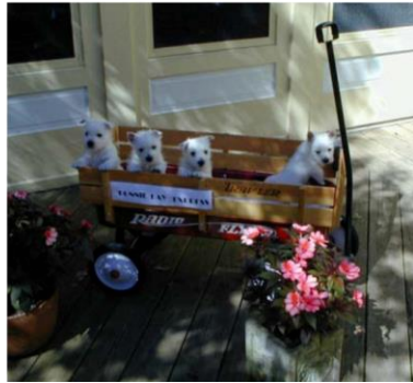
"WE'RE ON OUR WAY!"