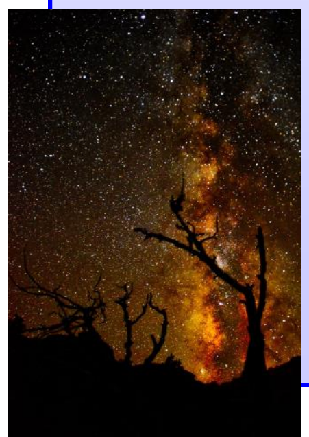
Joe Sutcliffe "Late Night"