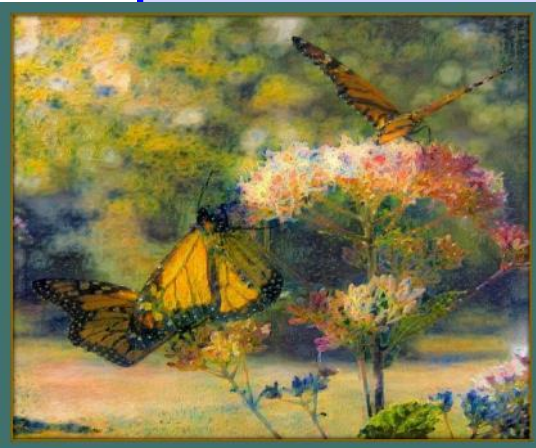
Barb Roper "Renoir Butterflies"