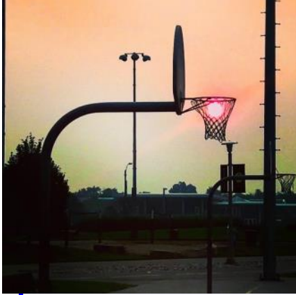
Lynda Clayton "Smoky Hoops"

Some sample pictures from our September meeting are shown below (choosing was difficult, as there were so many great pictures!). To see all of the May results, plus important club information and other cool stuff, go to our website at www.go-svps.org .