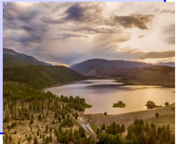
Cliff DeJong "Twin Lakes"