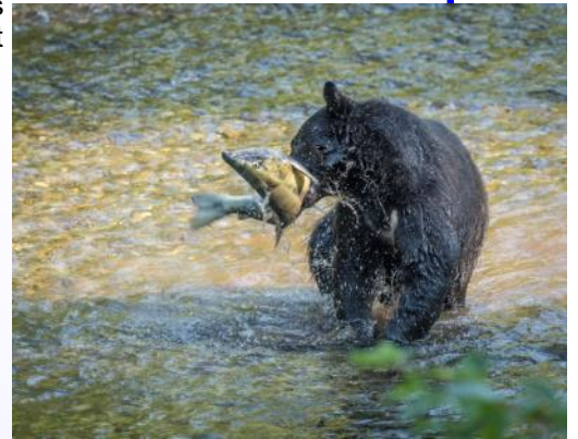
Vicki Braunagel "Black Bear Food Fight"