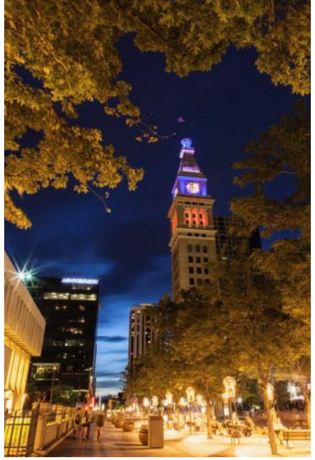
Jack Cornils "16th Street Lights"