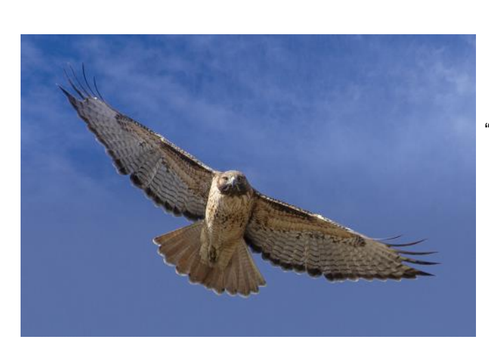
Cliff DeJong "Looking at Me"