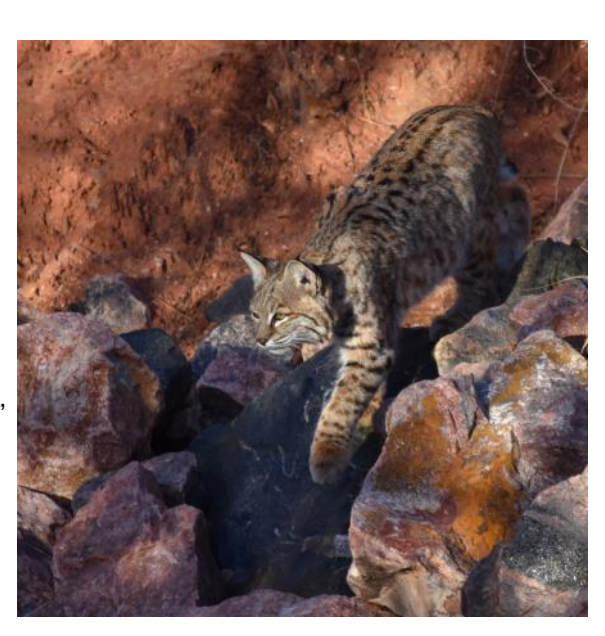
Bev Walkington "Stepping Carefully"