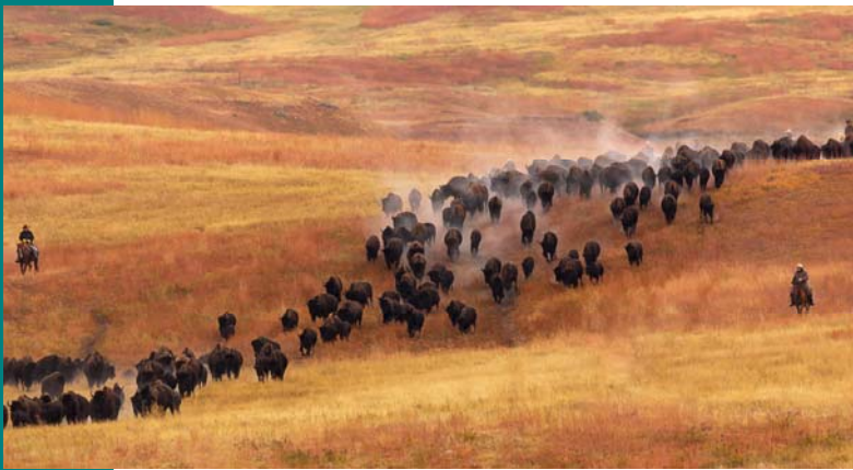
Buffalo Roundup—Todd Towell