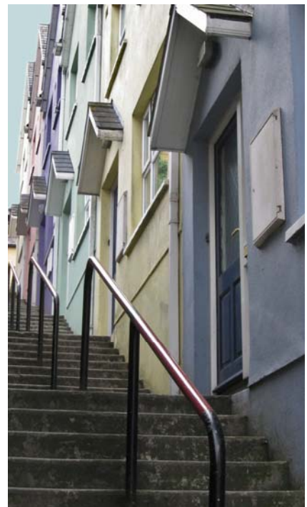
Kinsale Stairs—Lee Woodworth