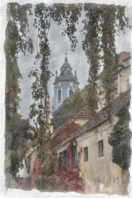
Village Walk in Watercolor and Ink Cliff DeJong