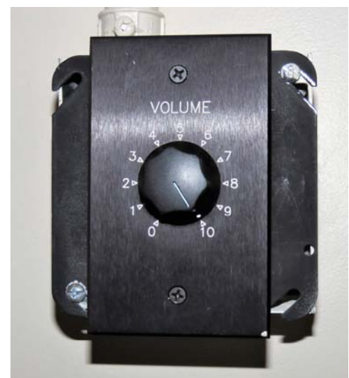
Black —Georgia Olmstead