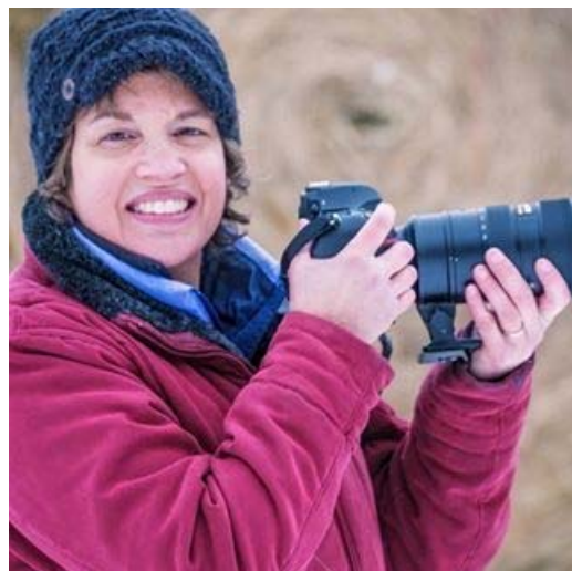
This pic "stolen" from Ellen's Facebook page.