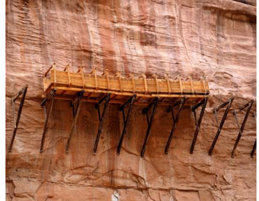
Restored Hanging Flume —Jim Bell