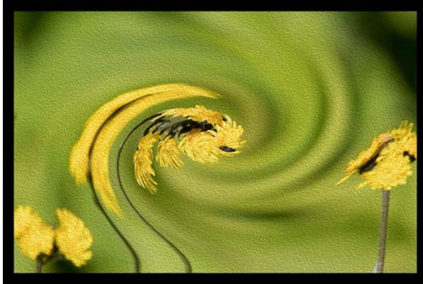
Flowers in Storm — Vickie Braunagel