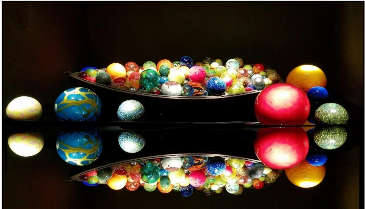
Chiuly Glass Boat Reflection ♦ Barb Roper

After you have submitted your photos, please verify the photos are in the correct category (1-12).