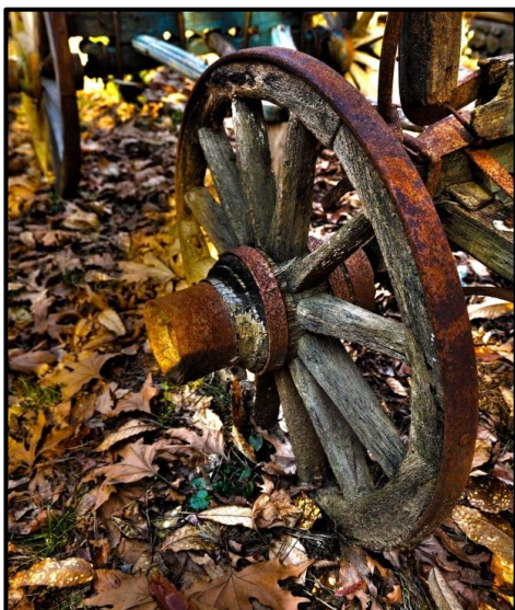
Cart Wheel Kamen Guentchev

Photos are restricted to the following criteria: Horizontal images will be no more than 1400 pixels wide or 1050 pixels tall. Vertical images will be no more than 1050 pixels tall. Save the file in jpeg format only. Unless your image proportions are in the exact ratio of 4 to 3, one of these dimensions will be less than the maximum. The images will be projected as received, as long as not over the maximum. (There are no file size restrictions.) sRGB color space is recommended for optimum results. File name restrictions are only those that are designated on the entry web page.