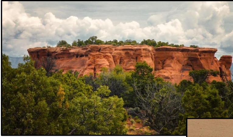
Cloud Throne Catherine Cook

“There are no bad pictures; that’s just how your face looks sometimes.”