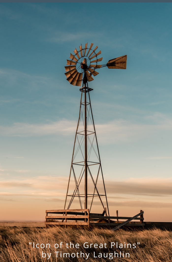
"Icon of the Great Plains" by Timothy Laughlin

**After rounds 1,2, and 3 our club is in 19th place (out of 23 clubs).