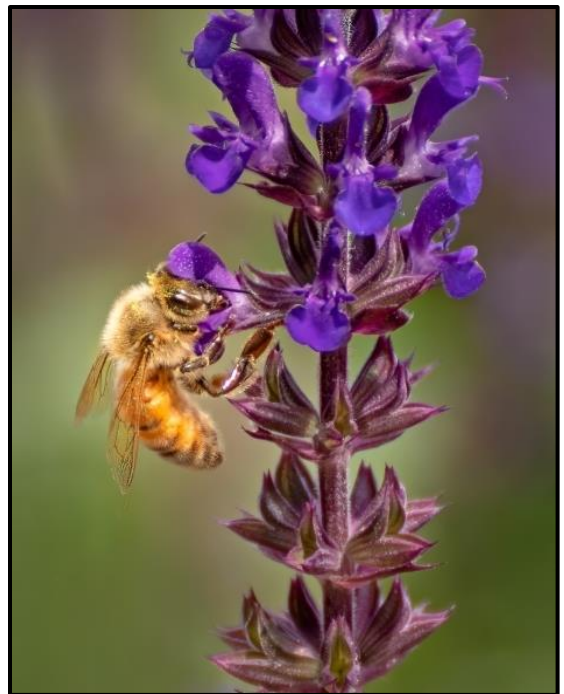
Bee in a Purple Bonnet ♦ Vicki Braunagel