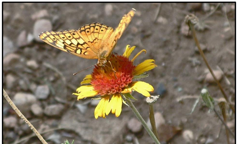
Variegated Fritillary on Blanket Flower