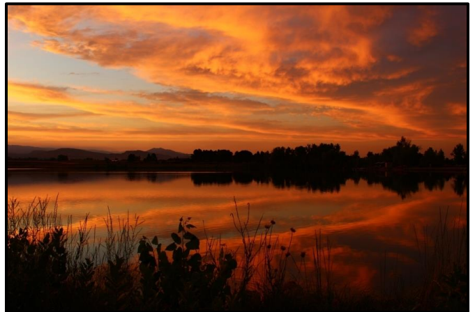
Clover Basin Reservoir on Fire