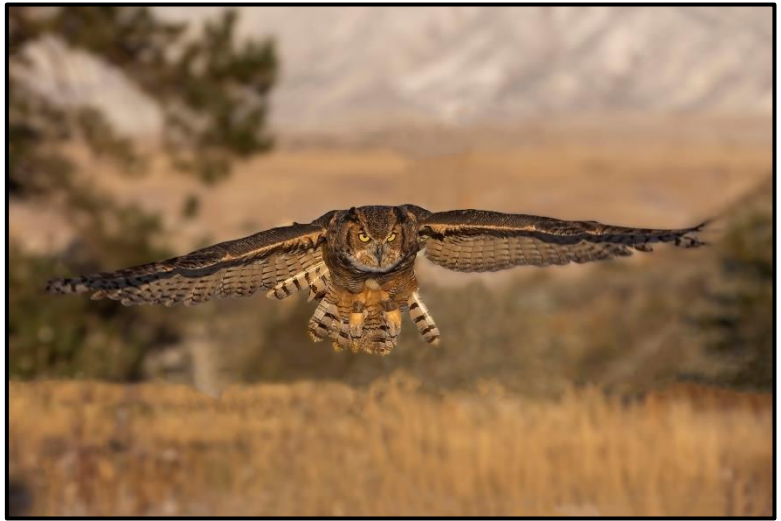
A Rabbit's Last View ♦ Cliff DeJong