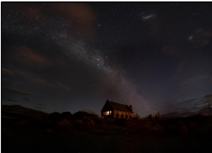
Church of the Good Shepard