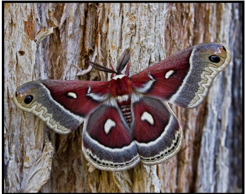
Columbia Silk Moth ♦ Leslie Larson