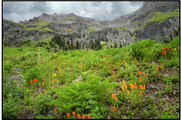
Where the Wildflowers Bloom ◆ Catherine Cook