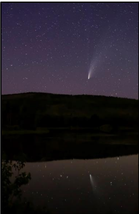
Neowise Comet ♦ Jack Cornils