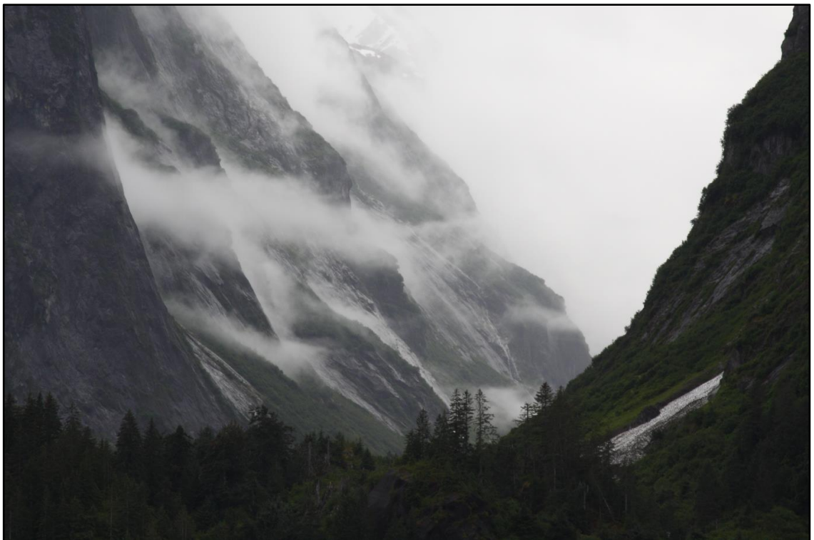
Fog on Fjord ♦ Cliff DeJong