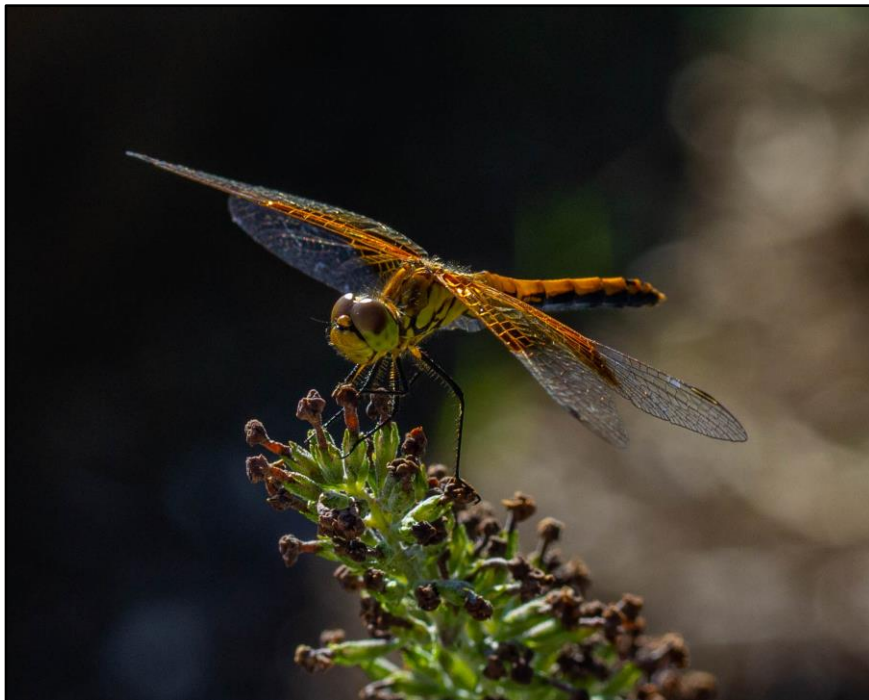
Golden Dragonfly 2 ♦ Elaine Hoffman