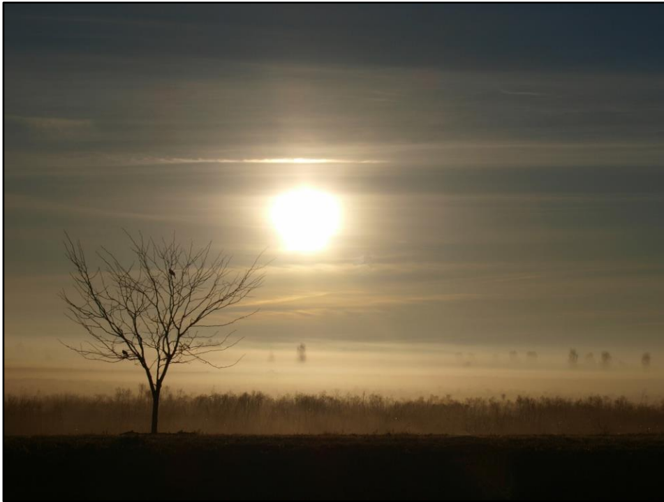
Early Morning Fog ♦ Barb Roper