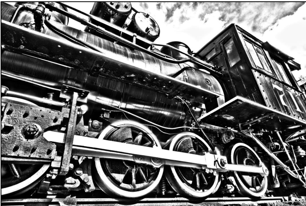
The Old Locomotive