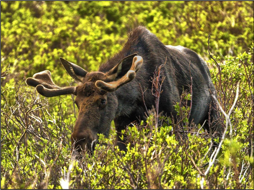
Moose at Brainard Lake ♦ Kamen Guentchev