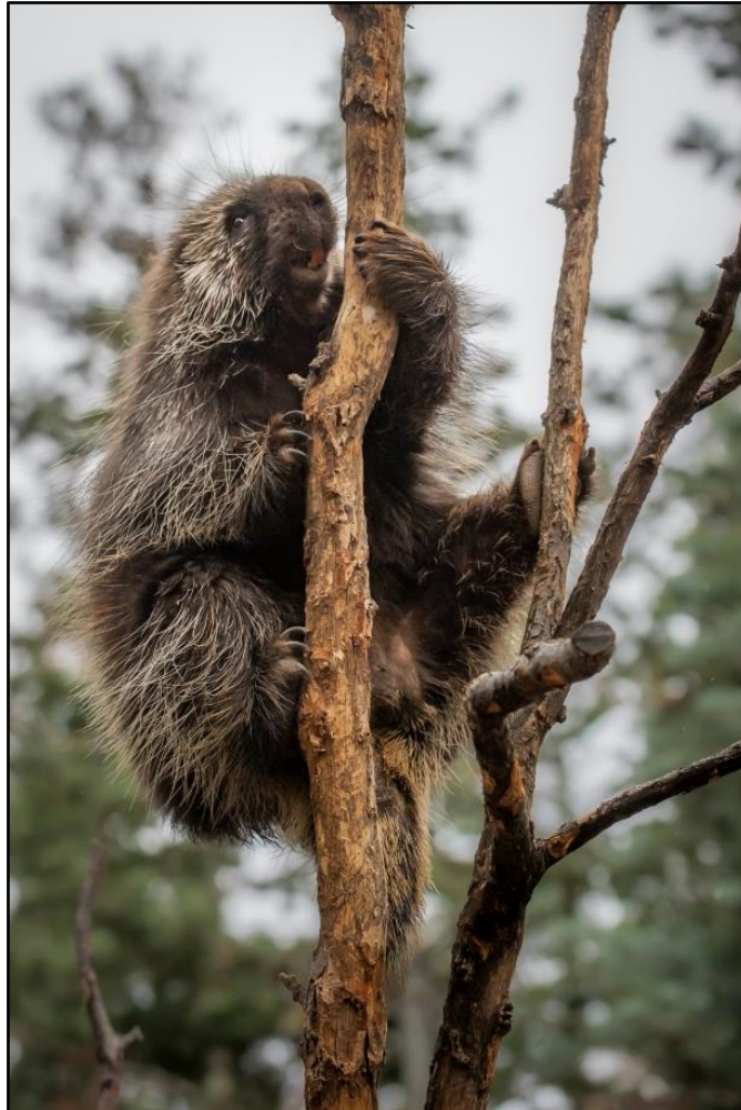
Porcupine at CM Zoo ♦ Greg Holden