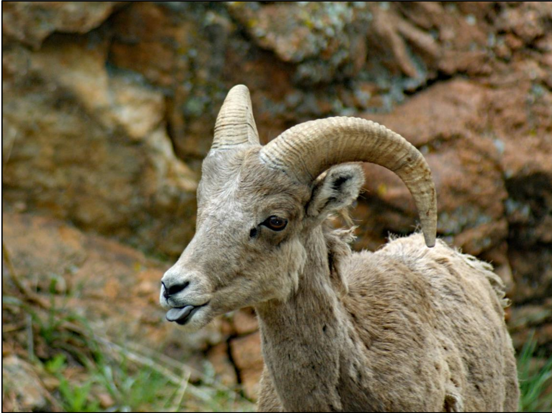
Bighorns in St. Vrain Canyon 3