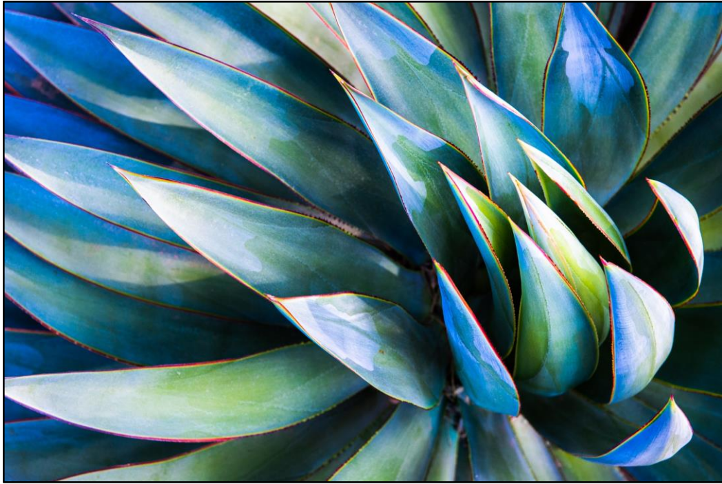
Aloe ♦ Greg Holden

SVPS Annual Competition 2 nd Place – Nature / Flowers – Other than wildlife