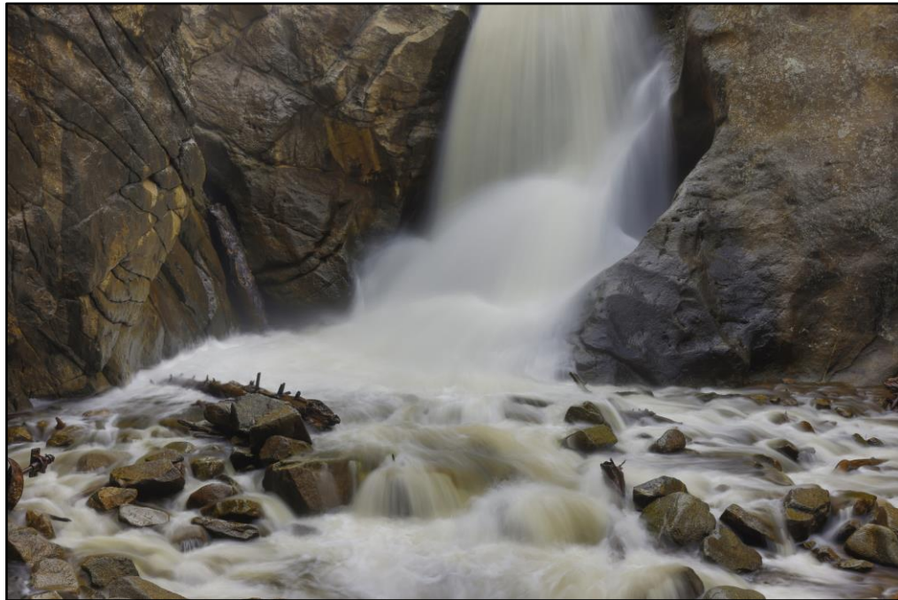
Boulder Falls ♦ Cliff DeJong

SVPS Annual Competition 3rd Place – Nature / Flowers – Other than wildlife