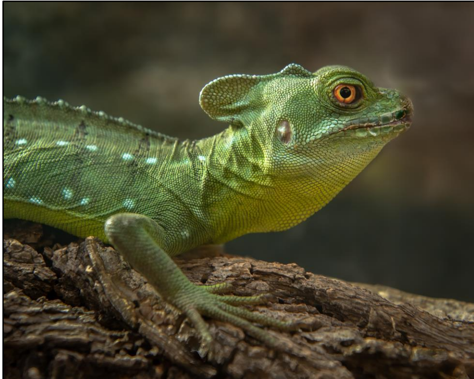
Basalisk Closeup ♦ Greg Holden

SVPS Annual Competition 3rd Place – Nature / Flowers – Other than wildlife