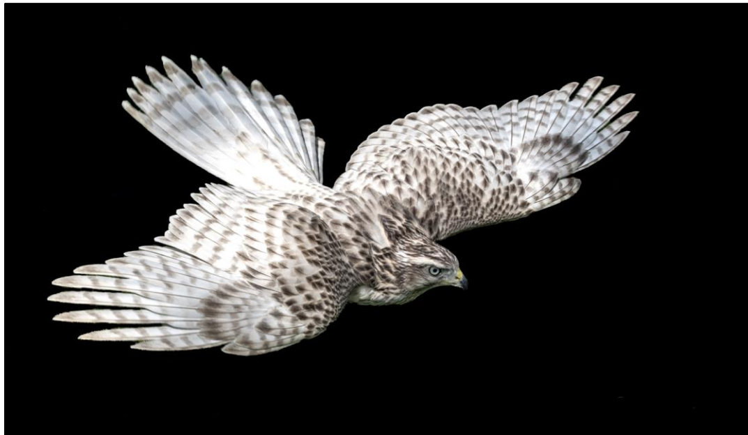
Siberian Goshawk