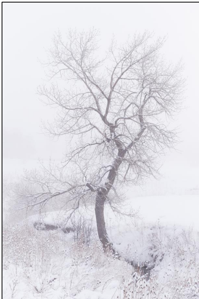
Tree in Snow Fog ♦ Greg Holden