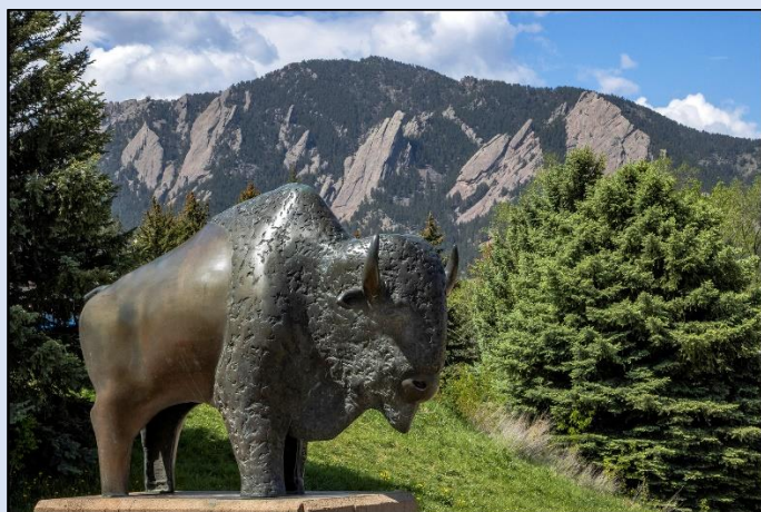
Boulder Icons