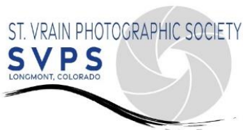
Photo Submission Rules are on the SVPS website: https://go-svps.com/monthly-showcase-rules

(The photo slide show and awards will also be on Zoom)