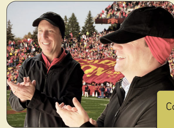
Cold night game.