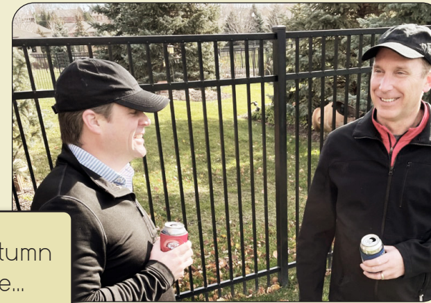
Warm autumn tailgate...