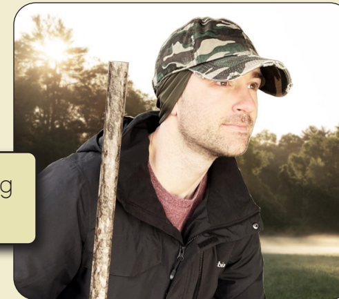
Early morning hunt...