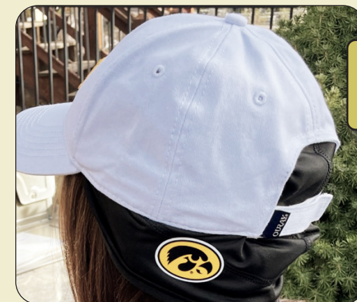
Or a house divided?