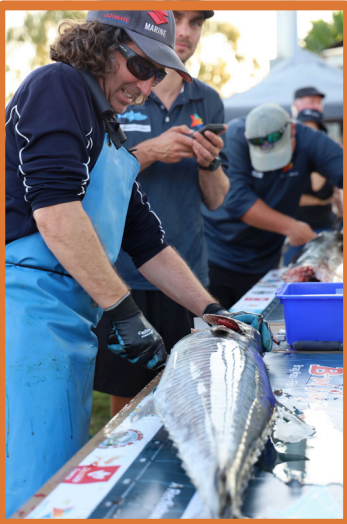
SPECIFIC SPECIES RESEARCH