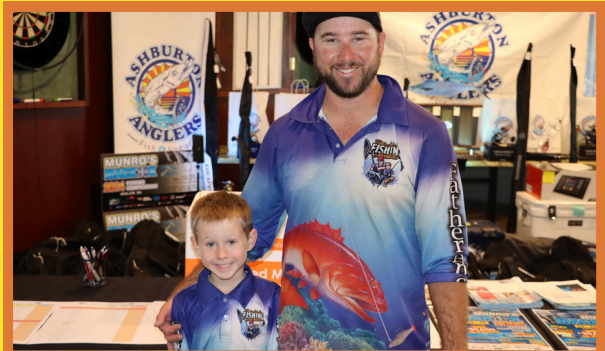
FAMILY FRIENDLY COMPETITIONS