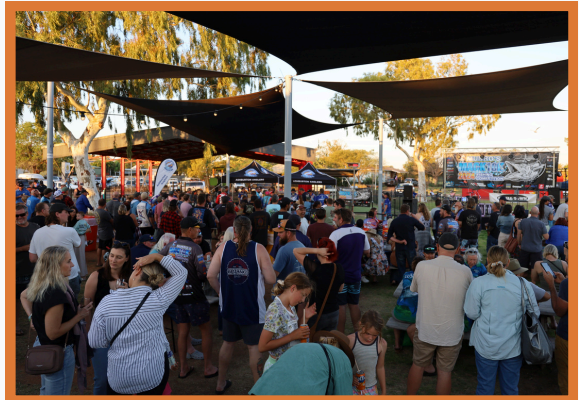
BRING COMMUNITIES TOGETHER