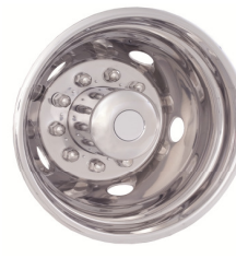
17" or 19.5" Stainless Steel Wheel Covers (Front & Rear) (Opt. on XL and XLT) – 945