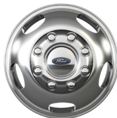
17" Forged Polished Aluminum w/bright hub cover/center ornament (Std. on Lariat F-350; Opt. on XL and XLT F- 350) – 64J