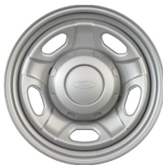
17" Argent Painted Steel w/painted hub cover/center ornament (Opt. on XL and XLT) – 64A