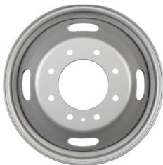
17" Argent Painted Steel (hub covers/center ornament not included) (Std. on XL and XLT F- 350) – 64K