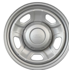
18" Argent Painted Steel w/painted hub cover/center ornament (Std. on XL F-350 SRW) – 64F