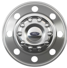
19.5" Forged Polished Aluminum w/bright hub cover/center ornament (Std. on Lariat F-450 and F-550; Opt. on XLT F-450 and F-550) – 64D