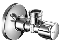
Schell regulating angle valve for Teka MY 1 SL052170699