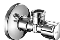
Schell regulating angle valve for Teka ML SL05210699