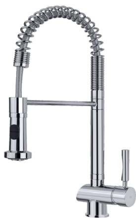
MY 1 Flexible spout mixer