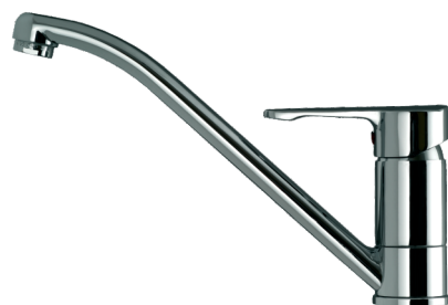
ML Swivel mixer