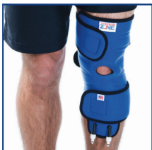
Knee Pad 003-17