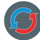
Motion Advantage Pads