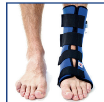
Ankle Pad 003-19