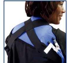
Cervical Strap 203-03 For use with 003-22