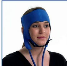
Front/Side Pad 003-10