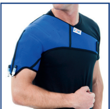
Reg. Shoulder Pad 003-15