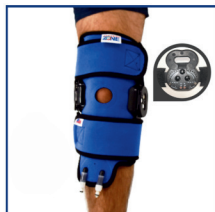
ROM Knee Brace 003-47