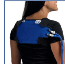
Universal Pad 003-22