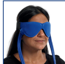
Eye Pad 003-12