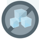
No Ice Needed

ThermaZone® is the iceless, thermal therapy, pain management device by Innovative Medical Equipment. Leveraging thermoelectric technology, ThermaZone circulates two ounces of distilled water through a closed-loop system, delivering and maintaining precise temperatures. ThermaZone's Motion Advantage™ pads are engineered to conform to specific anatomical pain points by combining soft, stretchable neoprene with flexible, welded microchannels. Safe, convenient and easy to operate, ThermaZone thermal therapy offers 20 selectable, consistent comfort levels ranging from 34°F to 125°F, plus five preset timer modes - three of which include automatic shutoff.