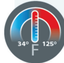
Broad Temperature Range