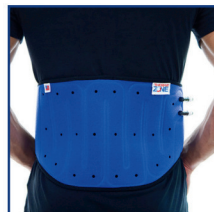
Back Pad 003-18