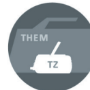
Smaller by Design