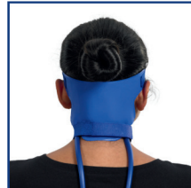
Occipital/Rear Pad 003-11