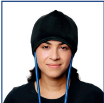
Full Head Cap 003-13