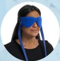
003-12 Eye Pad