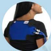
003-22 Universal Pad

Motion Advantage ™ Technology leverages precise fluid movement through welded microchannels, delivering uniform temperature distribution across the pad's surface for maximum coverage. Pads are interchangeable and bilateral.