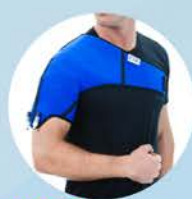
003-15 Shoulder Pad Fits up to 44" Chest