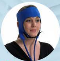
003-10 Front & Side Pad