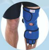
003-17 Knee/Straight Elbow Pad