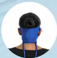
003-11 Occipital Pad