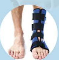
003-19 Ankle/90° Elbow Pad