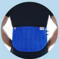
003-18 Back, Abdomen, Hip Pad