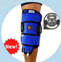
003-47 Range of Motion (ROM) Knee Brace Insurance Reimbursable - HCPC Code L1833