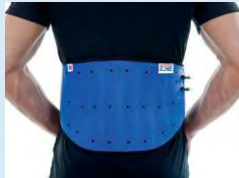
003-18 Back, Abdomen, Hip Pad V797D-50436 SPO200-20-H-0019