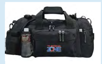
003-05 Carry Case (Holds unit and 4 pads) 003-03 Car Charger