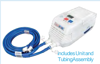
003-99 ThermaZone Therapy System