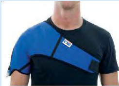
003-15 Shoulder Pad Fits up to a 44" Chest V797D-50436 SPO200-20-H-0019