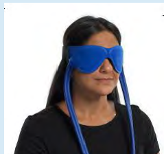
003-12 Eye Pad