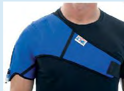
003-20 Large Shoulder Pad Fits up to a 54" Chest V797D-50436 SPO200-20-H-0019