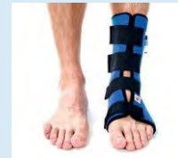
003-19 Ankle Pad V797D-50436 SPO200-20-H-0019