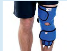
003-17 Knee, Elbow Pad V797D-50436 SPO200-20-H-0019