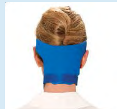
003-11 Occipital (Rear Head) Pad