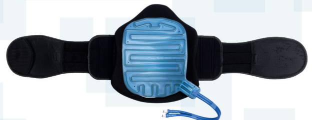
Shown with 14" support back panel