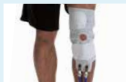
003-27 Knee Pad*