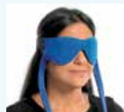
003-12 Eye Pad