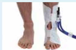
003-29 Ankle Pad*