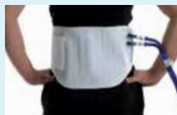
003-28 Back Pad*