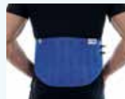
003-18 Back, Abdomen, Hip Pad*