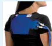
003-22 Universal Pad*