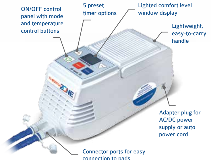
ON/OFF control panel with mode and temperature control buttons

Our pads feature Motion Advantage™ technology, which leverages precise fluid movement to deliver uniform temperature distribution across the surface of the pad for maximum coverage.