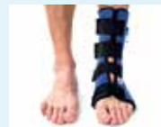
003-19 Ankle Pad*