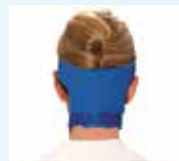
003-11 Occipital (Back of Head) Pad