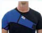
003-15 Shoulder Pad Fits up to a 44" Chest*