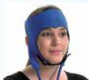
003-10 Front & Side Head Pad

Individual pads work in conjunction with the ThermaZone Thermal Therapy technology and are interchangeable with the unit.