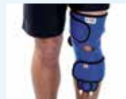
003-17 Knee, Elbow Pad*