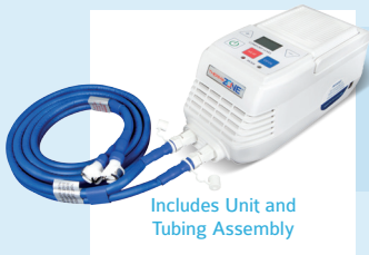
Includes Unit and Tubing Assembly

003-99 ThermaZone Unit with Medical Grade Power Supply