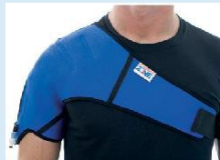
003-20 Large Shoulder Pad Fits up to a 54" Chest V797D-50436 SPO200-20-H-0019