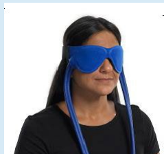
003-12 Eye Pad