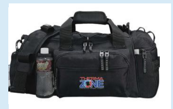
003-05 Carry Case (Holds unit and 4 pads) 003-03 Car Charger