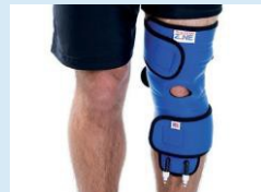
003-17 Knee, Elbow Pad V797D-50436 SPO200-20-H-0019