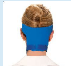
003-11 Occipital (Rear Head) Pad