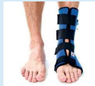
003-19 Ankle Pad V797D-50436 SPO200-20-H-0019