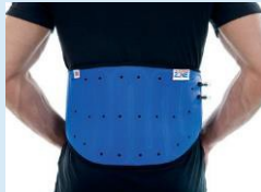
003-18 Back, Abdomen, Hip Pad V797D-50436 SPO200-20-H-0019