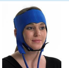
003-10 Front & Side Head Pad