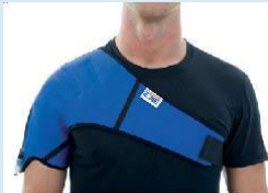
003-15 Shoulder Pad Fits up to a 44" Chest V797D-50436 SPO200-20-H-0019