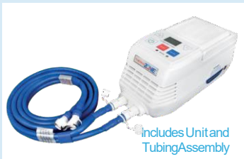
003-99 ThermaZone Therapy System