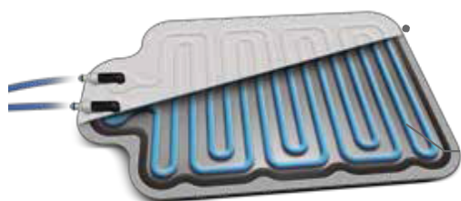
Temperature-controlled water flowing through welded microchannels

ThermaZone has a broad temperature range from 34° to 125°F. With 10 adjustable settings, patients can select the temperature based on their physician's recommendations and individual preferences.