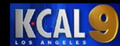
KCAL, Los Angeles