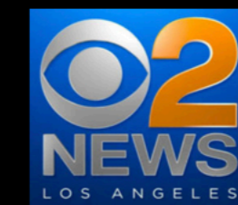
KCBS, Los Angeles