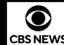
CBS Evening News