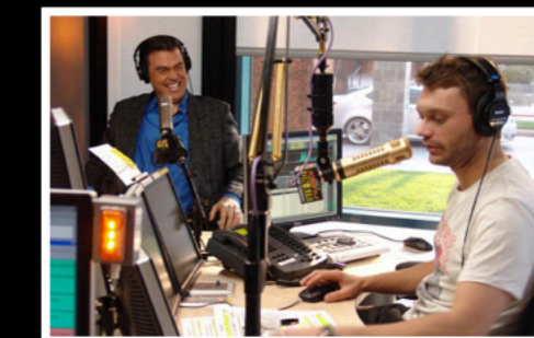
On-Air w/Ryan Seacrest