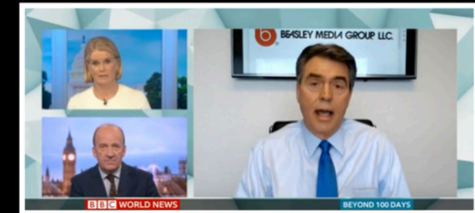
BBC World News