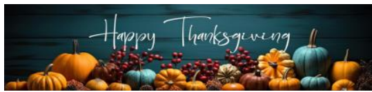
What's Up Wickliffe!