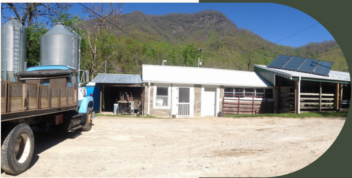
Innovation Brewing, Sylva, NC 25 KW Solar PV System

WNC ENERGY-CAP CONSERVATION ASSISTANCE PROGRAM