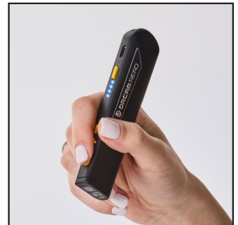
OrCam Read 5