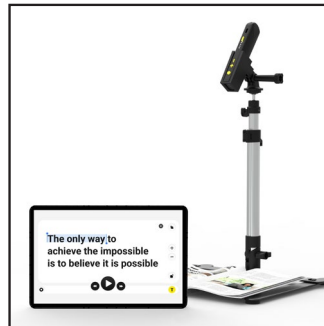
OrCam Read 3