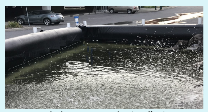
Recent deployment proves barrier effectiveness

During a recent urban flooding simulation exercise, FDS barriers held back almost 1m (3 ft) of water, and would have prevented this shopping mall from being completely overwhelmed