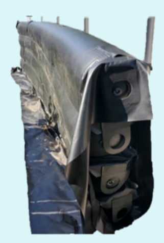
FDS 4 series: Up to 1.25m (50in) of protection