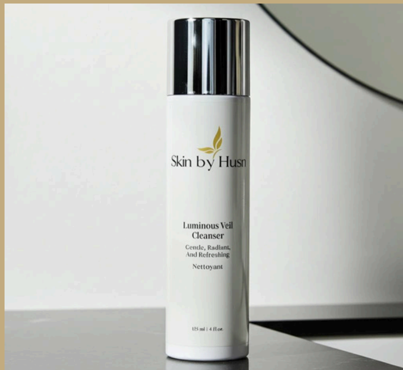
LUMINOUS VEIL Cleanser