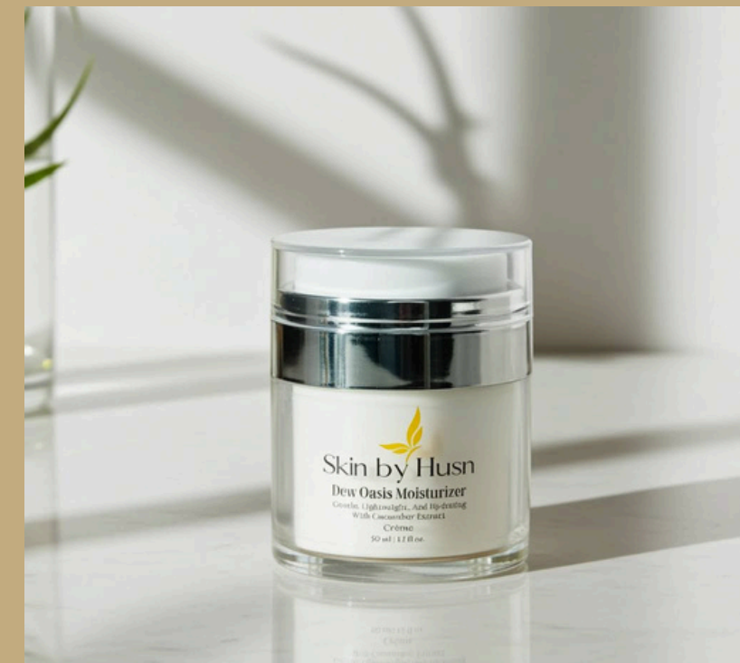
DEW AOSIS Hydrating moisturizer