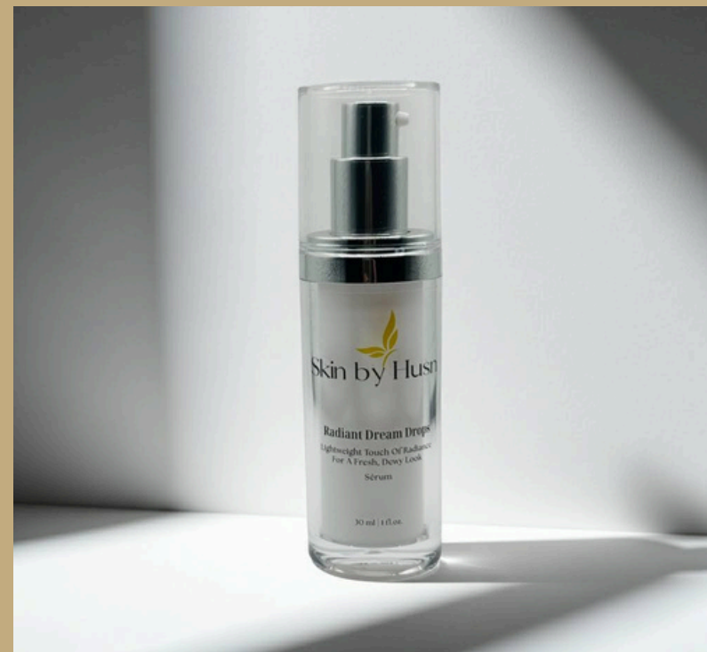
RADIANT DREAM DROPS Brightening serum