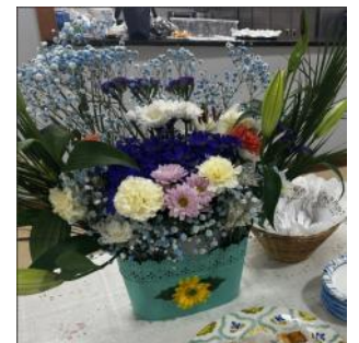
FLOWERS BY YANNOYLA MALKAS