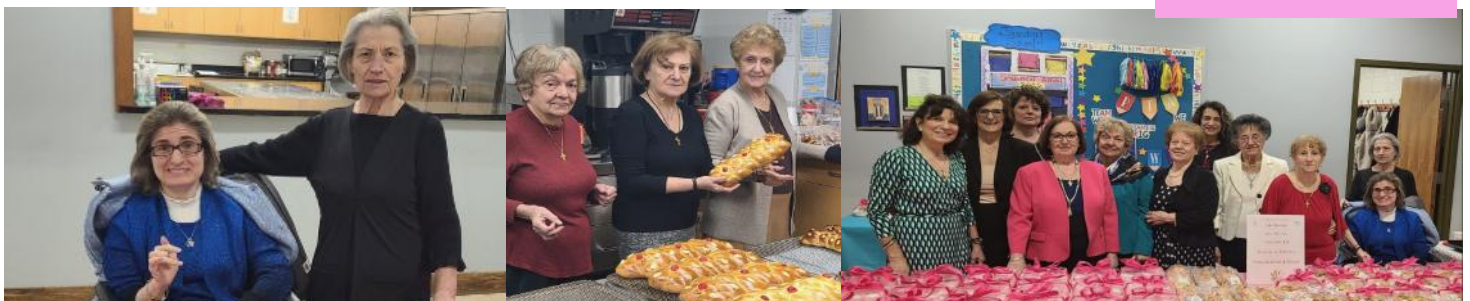
Our hardworking bakers never stop! Philoptochos worked tirelessly to offer our parishioners and friends the most delicious Tsourekia, kourabiethes and koulouria. Our appreciation goes out to all who constantly support us!