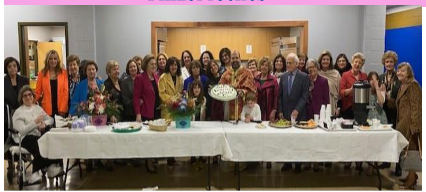
Dear Friends of Philoptochos