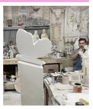
2023 Greektown public Art Project

Please register for next school year as soon as possible! September will be here before we know it and we need to plan resources accordingly. Registration forms have been mailed out to the families. Early bird tuition rate is available until May 26th.