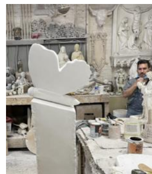
2023 Greektown public Art Project

Please register for next school year as soon as possible! September will be here before we know it and we need to plan resources accordingly. Registration forms have been mailed out to the families. Early bird tuition rate is available until May 26th.