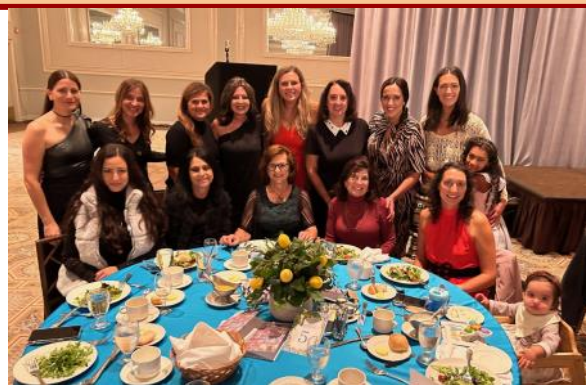
Members of our St. Spyridon Philoptochos attended the Holy Apostles Fashion Show on Saturday, October 21st.