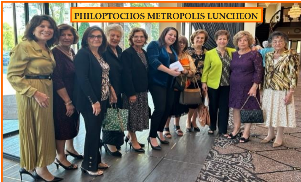
PHILOPTOCHOS METROPOLIS LUNCHEON