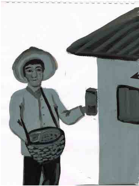
Original Sketch Idea from Client