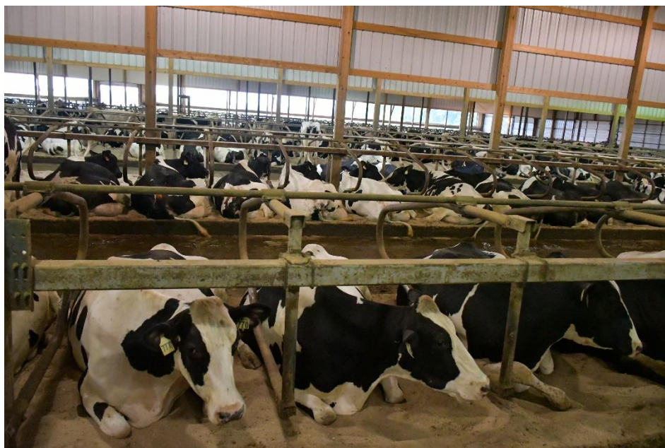
Figure 2. Cows lying uniform in a cross vent barn system that is overstocked by 150%

Farm B are producing very high volumes of milk (approx. 47.6 litres/day/cow) and with a low somatic cell count of 127,000 cells/ml. Farm B have excellent conception rates at 52%. The cross vent barn system allows for excellent ventilation. Despite the fact that the barn was overstocked by 150%, there was very little evidence of waiting or perching cows (Figure 2).