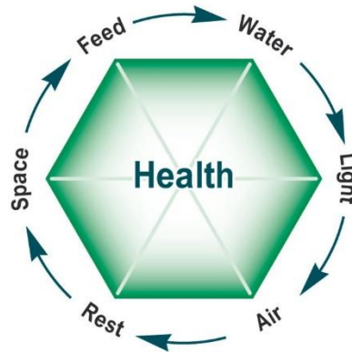
Figure 1. Diagram of the CowSignals diamond to assess the health of a dairy cow