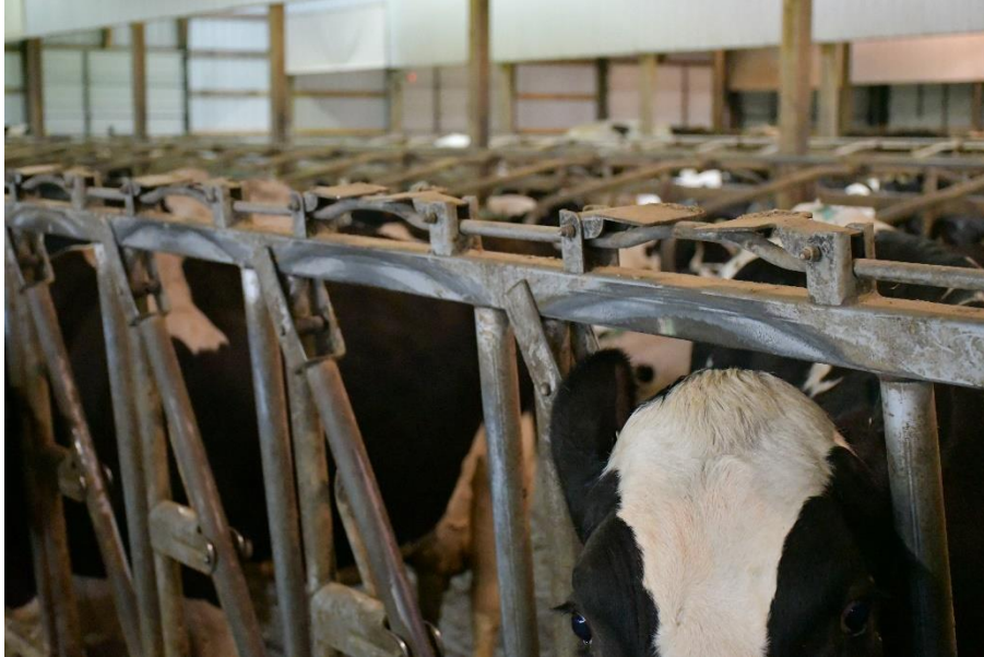
Figure 3. Shiny metal present at feed barrier. This was where the cows were scratching

The main CowSignals that were observed in this system was the presence of lots of shiny metal (Figure 3 & Figure 4) and the barn was rather noisy from the cows scratching at the feed barrier. This is an indication that there were no back scratchers present.