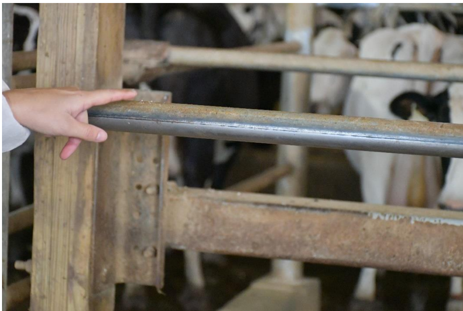
Figure 4. Shiny metal on neck rail