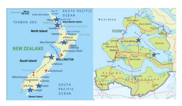
Figure 1: Locations of visits within New Zealand and the Netherlands

It was thereby proposed that visits to New Zealand and the Netherlands would allow increased knowledge and the opportunity to build good relations with aquaculture facilities and other educational and research institutions. (Figure 1)