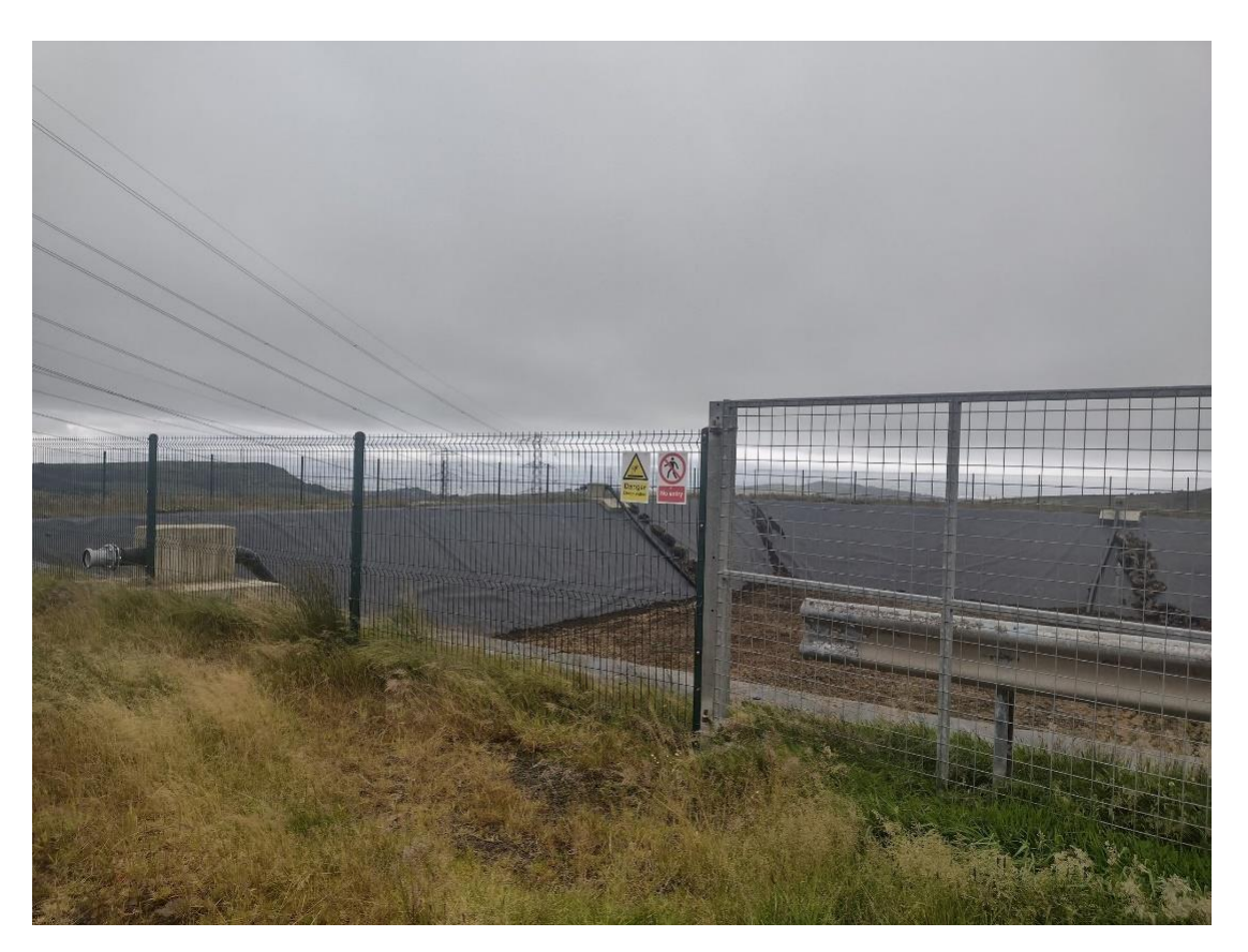
Figure 7: Slurry Lagoon, Low Ballees Farm

Yard developments have been pivotal in significantly reducing volume of slurry, with clean and dirty water managed entirely separately. Whilst clean water, such as roof water, is fed directly to the nearby water course, dirty water from areas such as concrete yards are now channelled into a series of ponds which provide a natural source of sediment filtration allowing water to be returned to the environment. These ponds have developed into a small wetland area, providing habitat for birds and waterfowl.