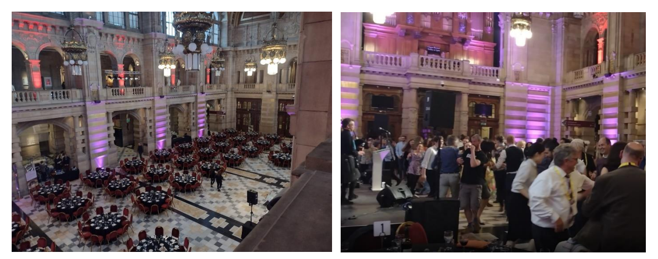
Figure 2: Congress diner at the Kelvingrove Museum

After three long days of congress proceedings, it would have been remiss of me not to attend the congress gala dinner held at the fabulous Kelvingrove Art Gallery and Museum. The museum was opened in 1901 as the "Palace of Fine Arts" and I was pleased in one regard that I had gone all out on a dinner jacket and UCR yellow bowtie, befitting for such a venue, however I felt immediately overdressed when I arrived to find only a hand-full of delegates in bow tie.