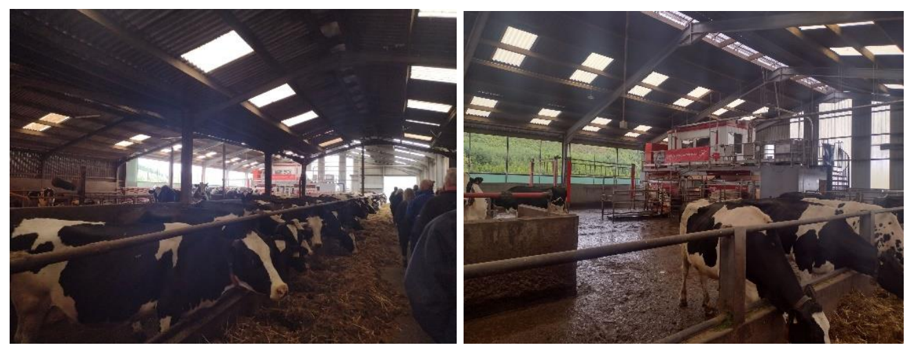
Figure 6: Low Ballees Dairy Farm