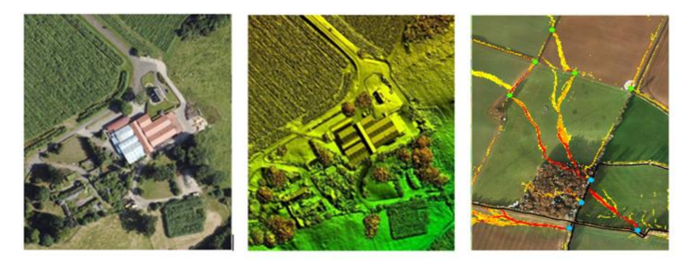
Figure 8: Comparison of an ordinary photograph compared to LiDAR (Van Rees, 2021) and example of identified hydrologically sensitive area map (Thomas et al., 2016)

LiDAR, an acronym for "light detection and ranging", is an active remote sensing technology which can measure landscape features. In practice, this technology operates through the use of laser lights which reflect off of objects, returning to the laser, creating what is referred to as a wave form. These peaks in light intensity represent objects on the ground such as hedges and trees. For decades LiDAR has been used to generate topography maps although has since been used for the collection of environmental data, for example vegetation structures, such as forest canopy height and cover, leaf area index and in some cases even species identification.