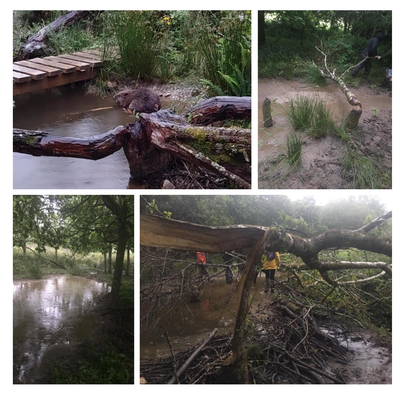
Figure 4: Beavers in their enclosure on Woodland Valley Farm

I was truly impressed by the impact the beavers are having in this woodland which is now a remarkable wetland habitat of dams, ponds and shallow streams; well worth the endless Cornish traffic jams for a visit.