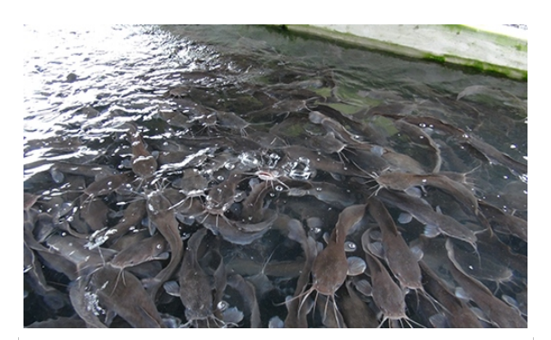
Fig. 2.2 African catfish stocked at high density

The African catfish is highly resilient to diseases (Edward et al., 2010), and has accessory breathing organs which allow it to survive during dry seasons (FAO Factsheet 1), and during my trip to Hungary I observed that stocking density was so high that the water was barely covering the fish. The fish are naturally adapted to live comfortably during draughts when water is scarce (Edward et al., 2010), and this also enables fish farmers to use