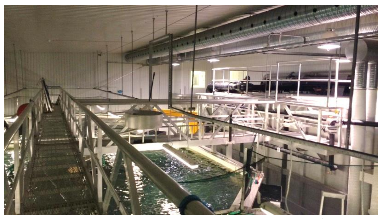
Fig. 4.9 Re-circulating Aquaculture System (RAS), NOFIMA Norway

Experiments are carried out on Atlantic salmon in Recirculating Aquaculture Systems (RAS) to understand the optimal conditions required to maximise growth rate and obtain good quality marketable salmon. RAS for Atlantic salmon farming is a relatively new area since the salmons' life history is complex, and their environmental requirements are very specific. Research is still needed to understand how to increase biomass and lower the incidence of mortality, while considering the welfare of the fish. I was impressed with the size of the RAS at NOFIMA (Fig. 4.9) and mostly how efficiently the researchers were monitoring the fish and maintaining the entire system.