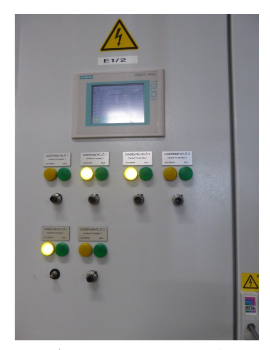
Fig. 3.7 RAS control panel