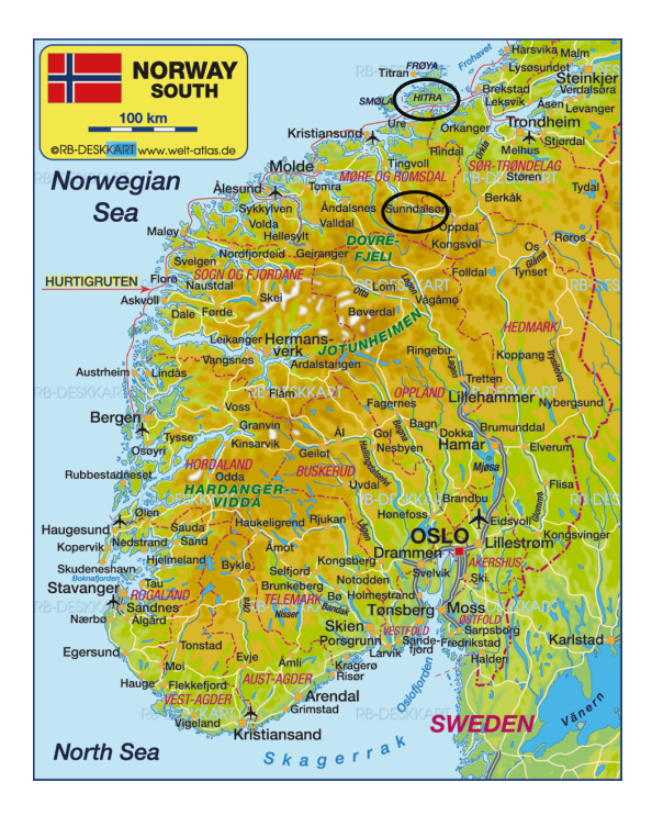
Fig. 4.1 Norway, showing the location of the research station (lower circle) and salmon farm (upper circle)

Aquaculture in Norway specialises in marine fish since it is surrounded by the North Sea and the Atlantic ocean (Fig. 4.1). Farming of Atlantic salmon is the most important activity, and accounts for more than 80% of the total Norwegian aquaculture production (FAO, 2017). Salmon are anadromous species, having a freshwater and saltwater phase in their life cycle. Salmon hatch as alevins, develop into parr (during which vertical 'parr' markings are visible). They then enter the smolt stage (salmon develop a silvery appearance and physiological adaptation to the marine environment). These life phases occur in onshore freshwater tanks. On-growing to market size takes place in offshore marine cages/open sea cages.