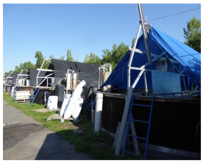
Fig. 3.8 African catfish farm, enclosures house sizespecific fish