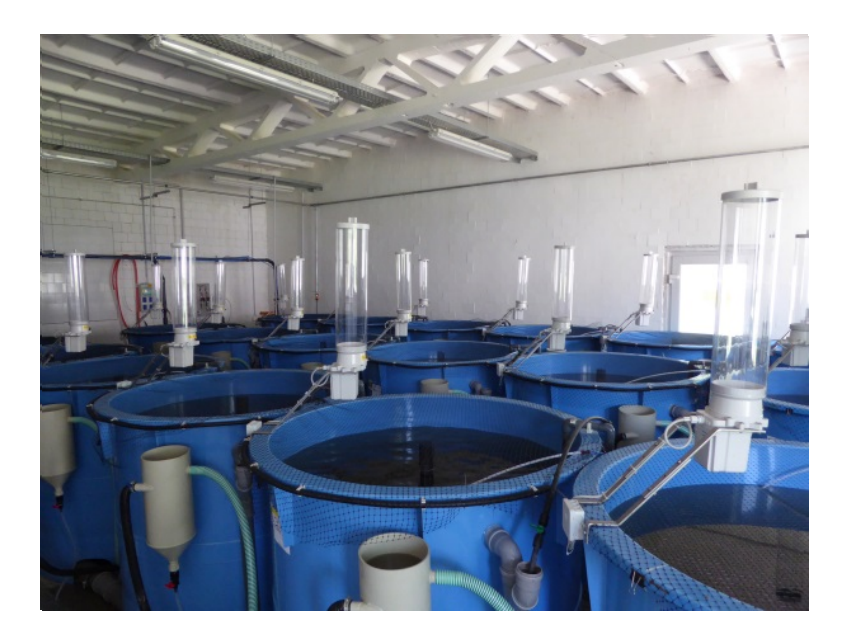
Fig. 3.3 Tanks containing common carp, grass carp, and sterlet stocked at high density