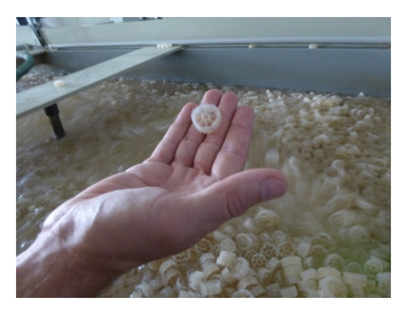
Fig. 3.6 Biofilter close up, HAKI

The whole RAS is controlled by a panel installed by the door (Fig. 3.7) so that farmers do not need to enter far into the farm, thus reducing any risk of contamination.