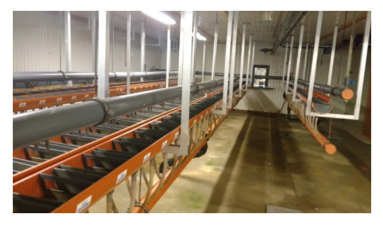
Fig. 4.3 Salmon hatchery tanks with pipes

tray is positioned on top. Finally each individual tank is covered with a lid to offer protection from light and the open air, thus limiting spread of disease.