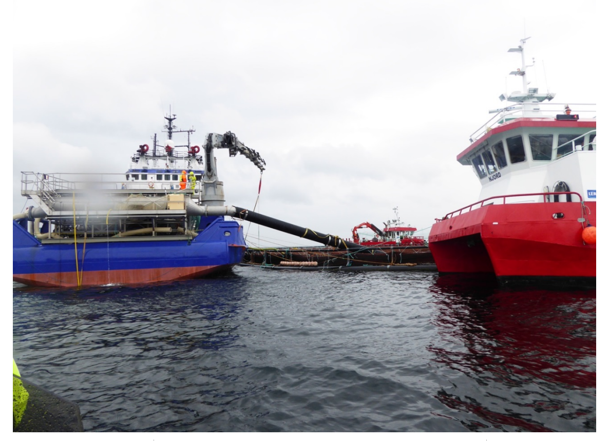
Fig. 4.17 Sea Lice warm water treatment

The females are significantly larger than the males (see top parasite in Fig. 4.16) The parasites attach themselves to salmon (the host), and the feeding of the parasites causes changes in mucus consistency and damage to the epithelium of the fish, which can result in blood loss. The sea lice detach from salmon when they enter the freshwater environment (when they migrate to their natal stream). They are also intolerant of warmer water temperatures, so fish farmers use a system to move salmon from open cages through a pipe filled with warmer water where the salmon are deloused, before returning to the sea cage (Fig. 4.17)