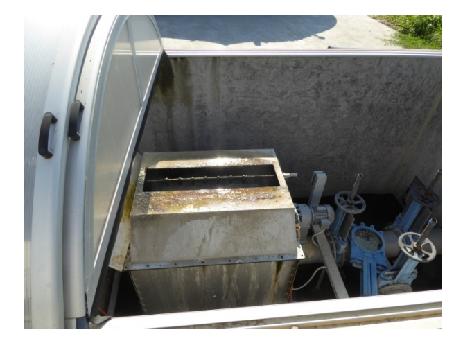
Fig. 3.11 Waste sediment is drawn out from the water

The farmers use crane-like equipment to haul large volumes of African catfish from the enclosure. Fish which are within marketable-size are sorted into crates (Fig. 3.10), ready to bring to another part of the farm for processing. Some buyers/consumers prefer fish that are smaller, others prefer the fish of a larger size. Fish are often sold as fillets ready for cooking.