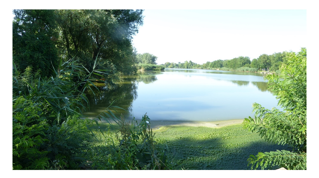
Fig. 3.18 Oxbow. Water composition study site

Several experiments were being undertaken during my visit to HAKI with study sites close by to the institutes. Groups of carp were closely fed and watched over time - a researcher uses a boat to move to each enclosure so that the fish can be fed and survival and condition index can be monitored (Fig. 3.17). A water composition study was also being undertaken at an oxbow near to HAKI (Fig. 3.18). The oxbow takes the effluent water from the catfish farm to surface waters. The study was to monitor the water quality, and I was able to assist the researchers in a boat to collect data for this study.