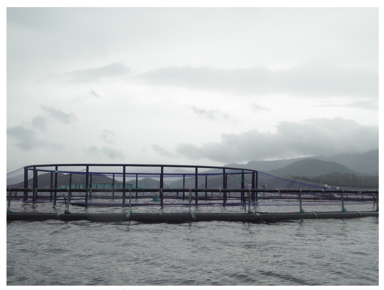
Fig. 4.15 Outdoor sea cage

The fish are fed, and vaccines are administered into the cage, so waste products and uneaten feed falls through the bottom of the cage onto the bottom of the ocean. This is clearly an environmental concern, so outdoor recirculating systems are being considered for the future of marine salmon fish farming, but we are still at the early stages of experimentation.