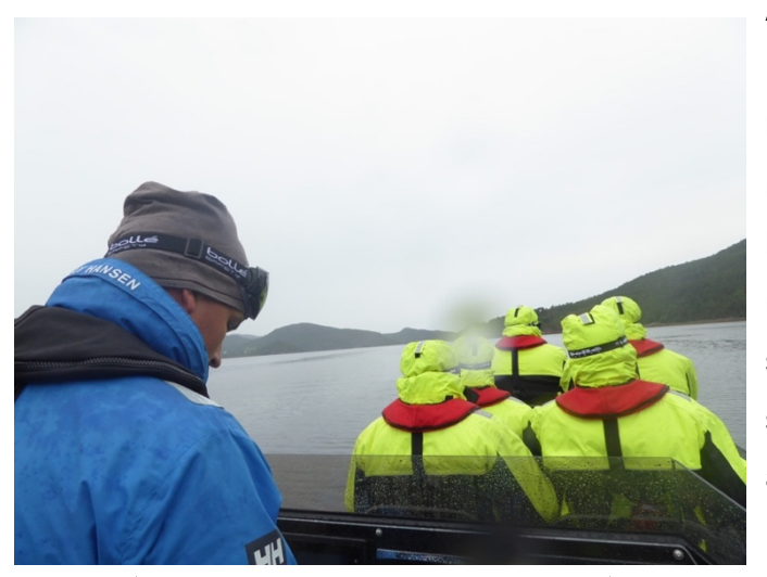
Fig. 4.11 High speed boat to Hitra

A high-speed boat was used to travel to Lerøy Belsvik (Fig. 4.11) to visit one of the biggest fish farms in the world. This was my first time on a boat going at such a high speed so I was both excited and nervous about the whole experience! The site has large living quarters for on-site staff who attend to the outdoor fish areas.