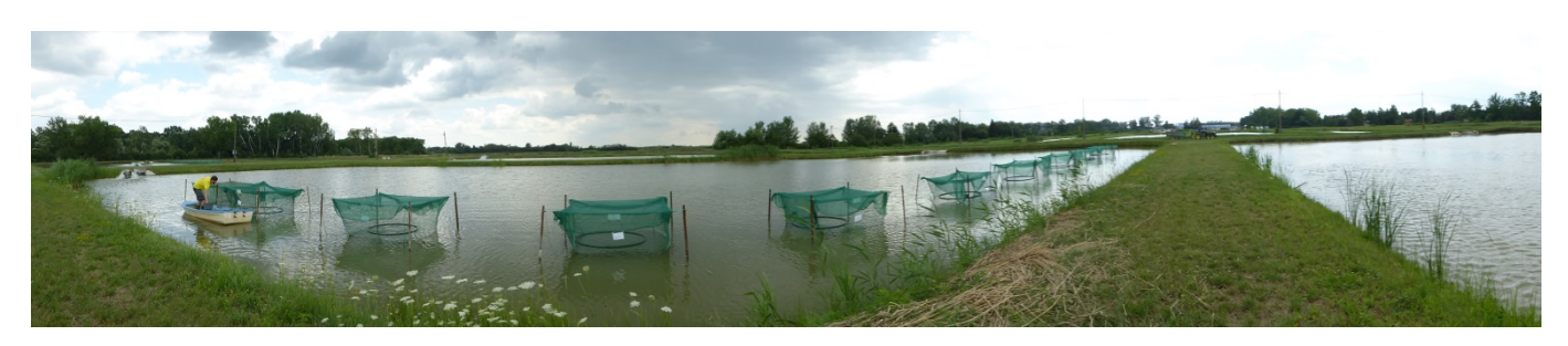
Fig. 3.17 Outdoor carp feeding experiment

Several experiments were being undertaken during my visit to HAKI with study sites close by to the institutes. Groups of carp were closely fed and watched over time - a researcher uses a boat to move to each enclosure so that the fish can be fed and survival and condition index can be monitored (Fig. 3.17). A water composition study was also being undertaken at an oxbow near to HAKI (Fig. 3.18). The oxbow takes the effluent water from the catfish farm to surface waters. The study was to monitor the water quality, and I was able to assist the researchers in a boat to collect data for this study.