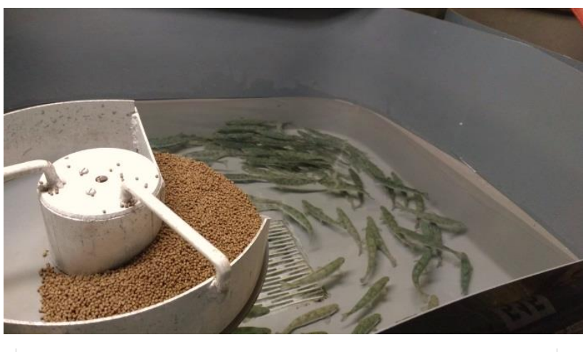
Fig. 4.6 Salmon feeding trials II

In the tanks used for feeding trials, water enters through the top large pipe running along above all the small individual enclosures (Fig. 4.5). Each enclosure receives water from the large pipe by opening the small red tap to fill the tank to the desired water level. The water after passing through each enclosure, passes through a pipe which extends from the enclosure into the ground. In this way, water does not pass between enclosures, thus studies on kinship, and water contamination are possible.