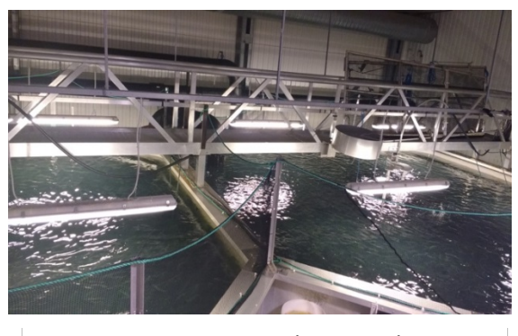
Fig. 4.10 Re-circulating tanks

The tanks of the recirculating system (Fig. 4.10) are much larger and deeper in comparison to the tanks used in the RAS in Hungary for catfish (compare with Fig. 3.3). The stocking density of Atlantic salmon is much lower, and they require much deeper waters, whereas catfish can survive in very shallow water and even droughts. The size of the tanks, and sheer volume of water, not to mention the temperature