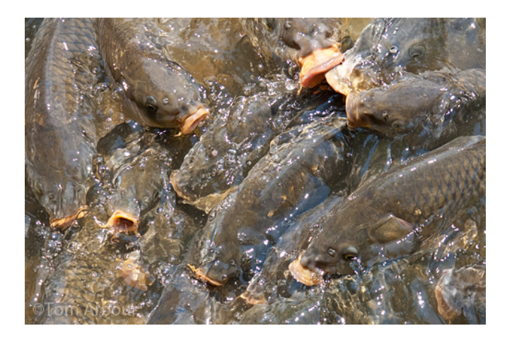
Fig. 2.5. Farmed common carp

Common carp (Fig. 2.5) is the third most widely produced freshwater fish species in the world (FAO, 2013), after grass carp and silver carp. Common carp is rarely produced in tanks or cages owing to the lower value of carp itself and the high costs in obtaining protein-rich foods like worms and snails. Therefore, most commercially farmed carp is produced in fish pond systems, and this is much more cost effective for producers (FAO, 2013).