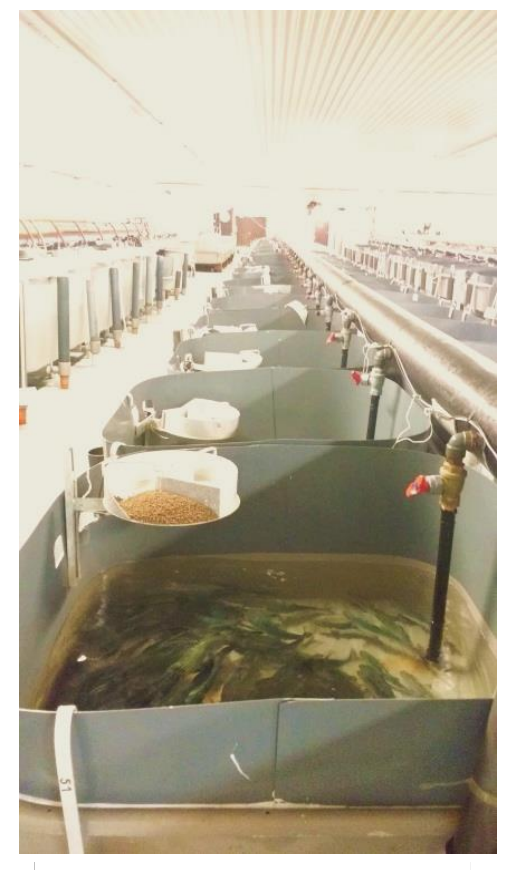
Fig. 4.7 Kinship studies