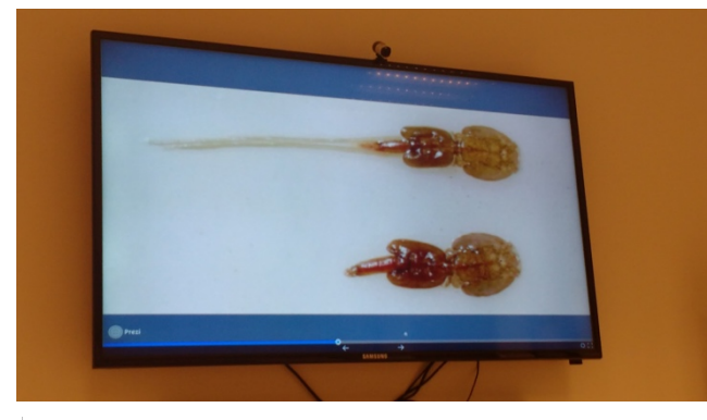
Fig. 4.16 Sea Lice

While I was at Lerøy Belsvik, I had the pleasure of attending a lecture about the evolution of fish farming techniques and technology. What interested me the most was the prevalence of disease and its management. Sea lice ( Caligus spp.) is one of the major ectoparasites that fish farmers are most concerned about, particularly in