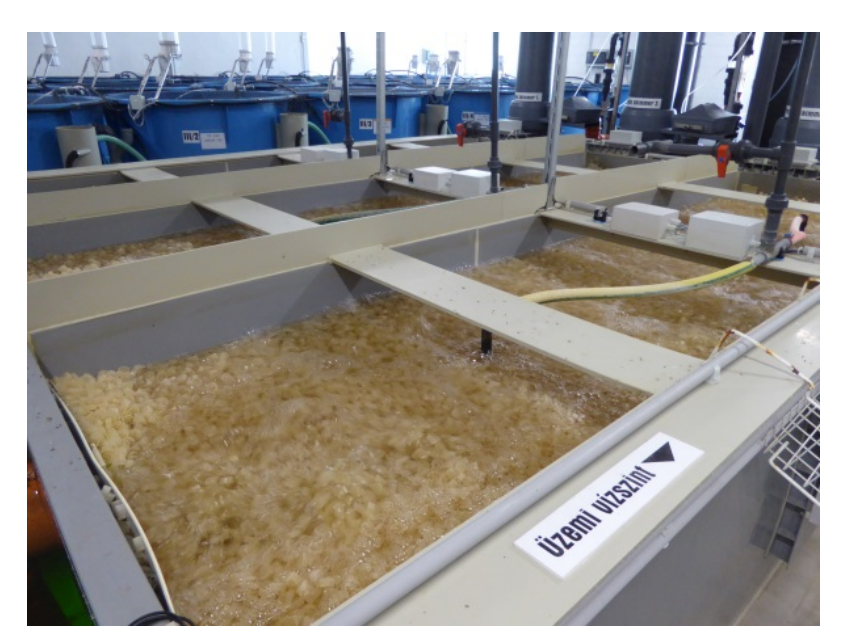
Fig. 3.5 Biofilter tank, HAKI