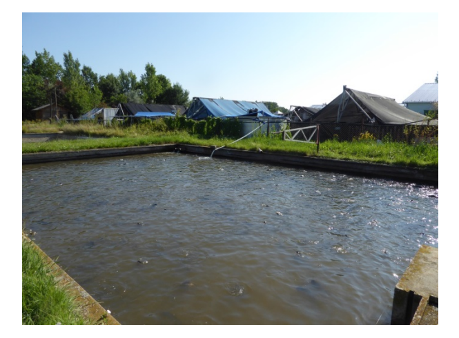
Fig. 3.12 Catfish outdoor enclosure

Water is filtered when it leaves the tanks (Fig. 3.11), and large particles including food debris and algae is removed before it moves into the outdoor enclosures where African catfish are farmed at a lower density (Fig. 3.12) and receive food which is controlled by a timer (Fig. 3.13). The effluent water runs through a constructed wetland system, which purifies the water before it is led to surface waters.