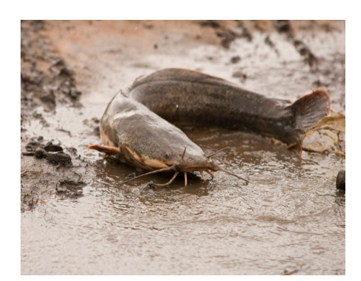
Fig. 2.1 North African catfish ( Clarias gariepinus )

North African catfish ( C. gariepinus ); simply referred to as 'African catfish' (Fig. 2.1) is a freshwater fish with a pan-African distribution. They are also native to the streams in Jordan and Israel, and it is an introduced species to some rivers of Turkey (FAO Factsheet). The fish have slender eellike bodies, with flat bony heads and four pairs of barbels. African catfish are found in lakes, streams, rivers, swamps and floodplains, many of which have low water levels or are subjected to drying in hot months. According to the IUCN (2017), it is not a threatened species.