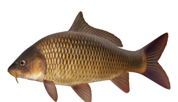
Fig. 2.4 Common Carp ( Cyprinus carpio )

Common carp ( Cyprinus carpio ) (Fig. 2.4) are a brownish-green colour on the back and upper sides, and are golden ventrally. They have an elongated and compressed body, and thick lips (FAO Factsheet 2). The common carp has one long dorsal fin with hard and soft rays. They are found in a large temperature range of 3 -35C, and the optimal water temperature for growth is between 20–25 °C (Froese and Pauly, 2011). According to Freyhof and Kottelat