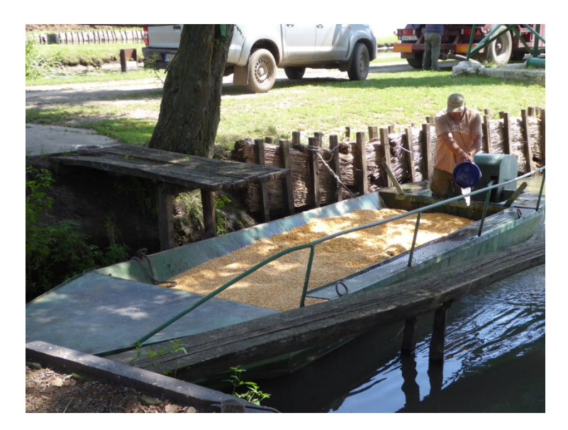
Fig. 3.15 Grain feed

Fish feed on naturally occurring organisms like worms and larvae. Additional feed (grain) is provided so that the farmers can maximise production (Fig. 3.15). The boat has an opening at the bottom which allows the farmer to distribute the feed in a controlled manner (Fig 3.16). Around 8-10 tons of manure is distributed per hectare - it encourages flies and worms to appear and therefore seems to enhance the pond environment and the production of fish. No antibiotics are used. The farm appears to maintain a totally natural system. Everything that enters the farm must be verified so that it can be used in this 'bioproduction' system. The price of "biofish" and normal/non-biofish is the same, but in time the hope is that Hungarian consumers will favour naturally farmed fish bioproduced fish, over other more intensive methods of farming fish.