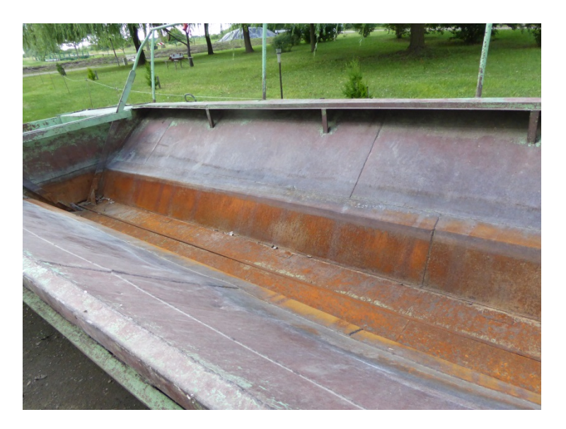
Fig. 3.16 Boat used to distribute grain