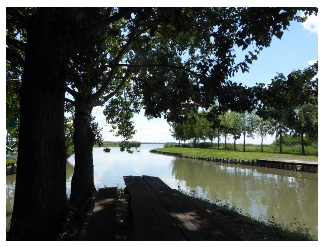
Fig. 3.14 162 hectares of pond area producing 300 tons of fish per year

Larvae is sourced from other locations independent from the fish farm. In 162 hectares of pond area, 300 tons of market-sized fish is produced per year (Fig. 3.14). The ponds are flooded in the Spring by rain and overflow from channels and streams. At the end of the first season, fish reach around 50-100g. At the end of the second season fish weigh in at around 400-600g (Summer). By the end of the third season (Autumn), fish have gained a significant amount of weight and are around 2.5kg and are harvested. It is normal at the end of the first season for the fish farmers to record a 90% loss. At the end of the second season a 50% is often seen, but by the end of the third season it plummets to a 10-20% loss. Loss of biomass/production is due to the fish not feeding for 2-3 weeks, therefore grain is given to supplement their natural diet.