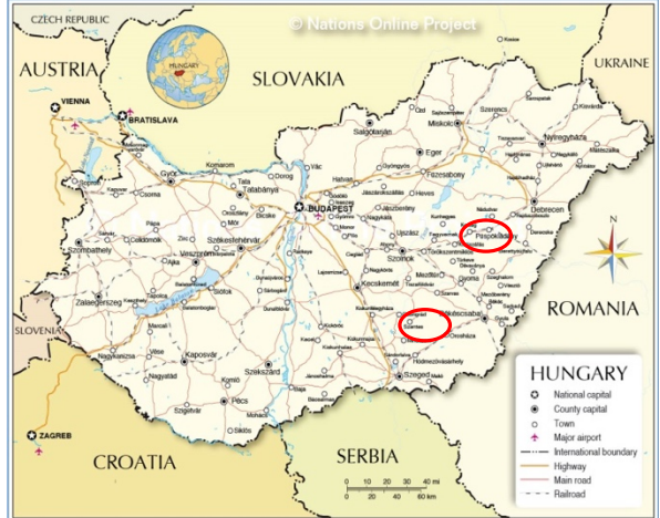
Fig. 3.1 Hungary, showing the location of the research station (lower circle) and carp farm (upper circle).

Hungarian aquaculture possesses some special characteristics, for example, its worldwide reputation in carp breeding. The total area covered by fish ponds in Hungary is approximately 28,000 ha with the majority species farmed being common carp ( Cyprinus carpio ). Hungary's carp production is the third largest in Europe and represents 74% of the total fish production in Hungary. More than 10% of production comes intensive fish farming of mainly European catfish, sturgeon species, and some pikeperch. Around 7% of production comes from geothermal intensive water systems, in which the major species farmed is the North African catfish ( Clarias gariepinus ) (FAO, 2017).