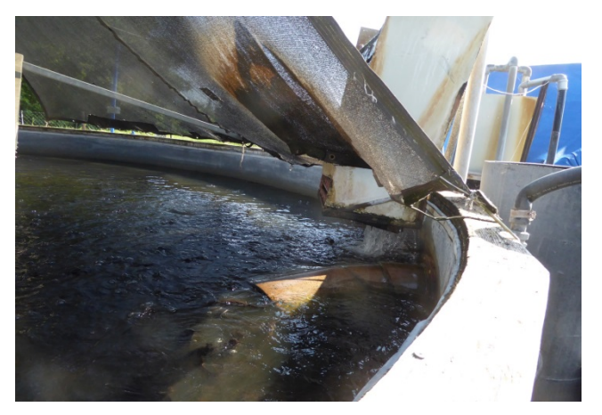
Fig. 3.9 Trickling tower is installed to remove CO_2 from the water

The African catfish farm (Szarvas-Fish) I visited is one of two sites. African catfish at the farm are housed in enclosures which support specific sized-ranged fish. They are fed with pellets, and the water is not recirculated (Fig. 3.8). The propagation methods and hatchery processes take place at the other site. Propagation takes place 4-5 times a year. The fish arrive at this site at around 40-50g. There are different size groups ranging from around 50g to 3-4kg, hence the number of different enclosures seen in Fig. 3.8.