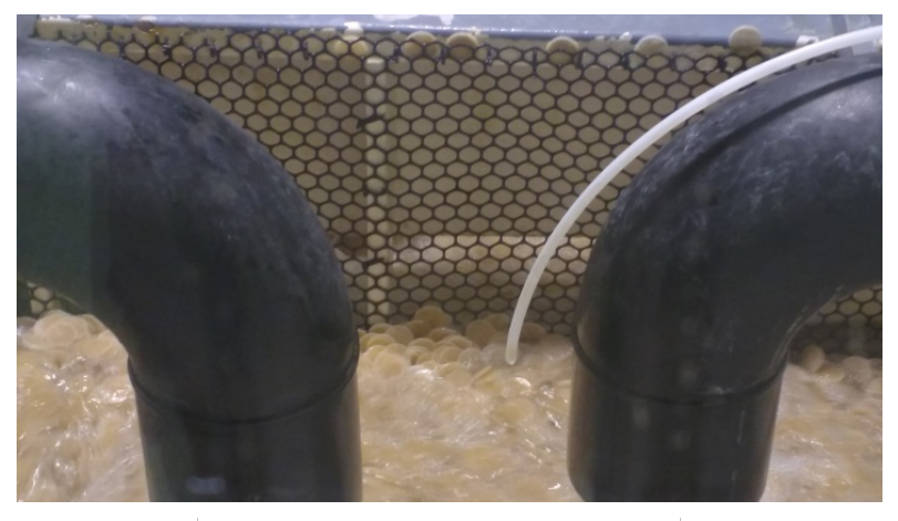
Fig. 4.13 biofilter tank, Hitra

My most interesting find at Hitra were the biofilters that are used to clean the recirculating water (Fig. 4.13). The biofilters used in Norway were of a different shape and size the biofilters I observed in Hungary (compare with Fig. 3.6), although I learnt that the surface area is what is of most importance – so that a larger amount of space is available to support and larger volume of bacteria that convert ammonia to less-toxic nitrate (Fig. 4.14).