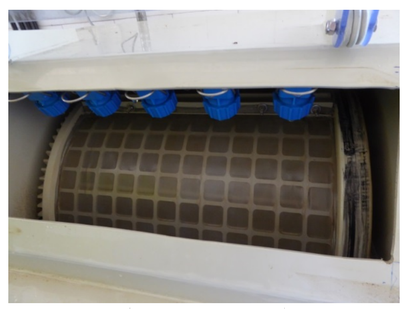
Fig. 3.4 Mesh filter drum

The whole set up of the RAS is fascinating. Since it is a recirculating system, a vast majority of water is reused, therefore it needs to be cleaned after each cylce. A small fraction of water is lost after each cycle through bio-filtering and removal of waste, therefore a small fraction of water is added to the tanks in each cycle. The cycle starts with the water in the tanks (Fig. 3.3) containing the fish. The water then leaves the tanks and passes through a mesh filter drum to remove large waste particles (Fig. 3.4). Often this waste product can be used as a fertiliser for plants or aquaponics systems. Once the water has passed through the mesh filter, it then enters tanks which contain biofilters (Fig. 3.5).