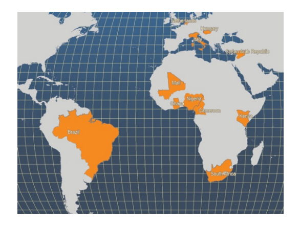
Fig. 2.3. Main producer countries of North African catfish ( C. gariepinus )

less water which is much more cost effective and environmentally friendlier. African catfish are considered to be one of the most important and sought after tropical freshwater fish species, producing high yields in the aquaculture environment (Dada and Wonah, 2003). C. gariepinus has a high fecundity rate, tolerates high stocking densities (Fig. 2.2) along with environmental extremes, and accepts a varied diet of both natural and artificial food (Bruton, 1979).