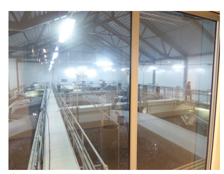
Fig. 4.12 Indoor salmon hatchery farm

A high-speed boat was used to travel to Lerøy Belsvik (Fig. 4.11) to visit one of the biggest fish farms in the world. This was my first time on a boat going at such a high speed so I was both excited and nervous about the whole experience! The site has large living quarters for on-site staff who attend to the outdoor fish areas.