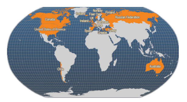
Fig. 2.8 Main producer countries of Atlantic salmon ( Salmo salar )

Most of the research into salmon farming is undertaken in Northern European producing countries (Fig. 2.8), and tends to focus on developing economies, reducing unit production costs, and protecting profit margins. It seems likely that future production surges will occur in Chile, where costs of production tend to be lower, owing to lower cost of labour and raw materials (FAO, 2017). Disease susceptibility is a major problem for Atlantic salmon farmers. In fact, it can be