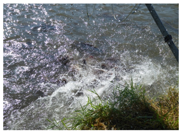
Fig. 3.13 Outdoor reared fish: Controlled Feeding

Water is filtered when it leaves the tanks (Fig. 3.11), and large particles including food debris and algae is removed before it moves into the outdoor enclosures where African catfish are farmed at a lower density (Fig. 3.12) and receive food which is controlled by a timer (Fig. 3.13). The effluent water runs through a constructed wetland system, which purifies the water before it is led to surface waters.