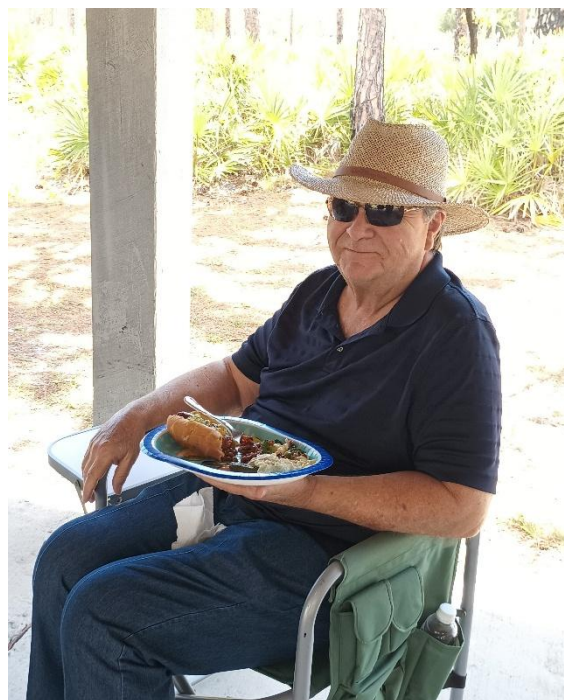
Nice Plate of Food