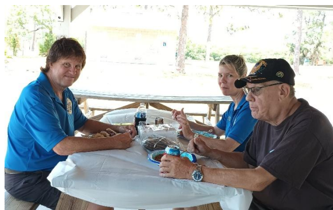
The Picnic with lots of eats!