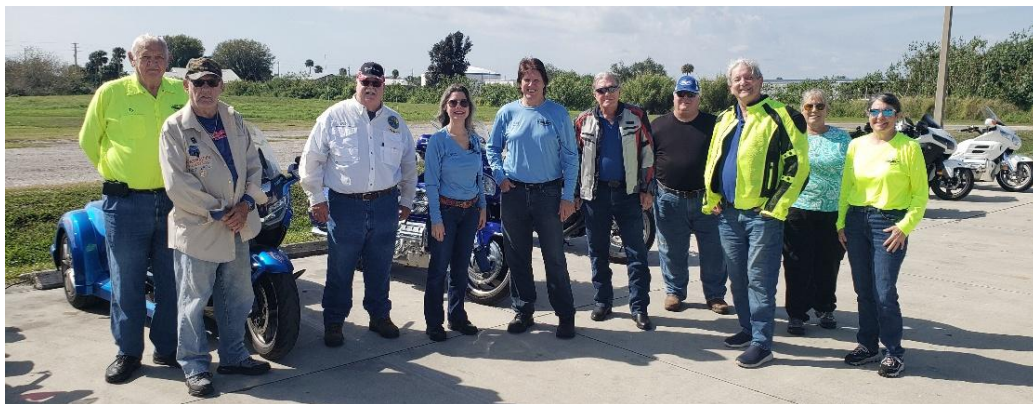
FL2-O Stuart – Treasure Coast Riders - 2025

I'm looking for pictures of rides, trips, new accessories/bikes with a quote.