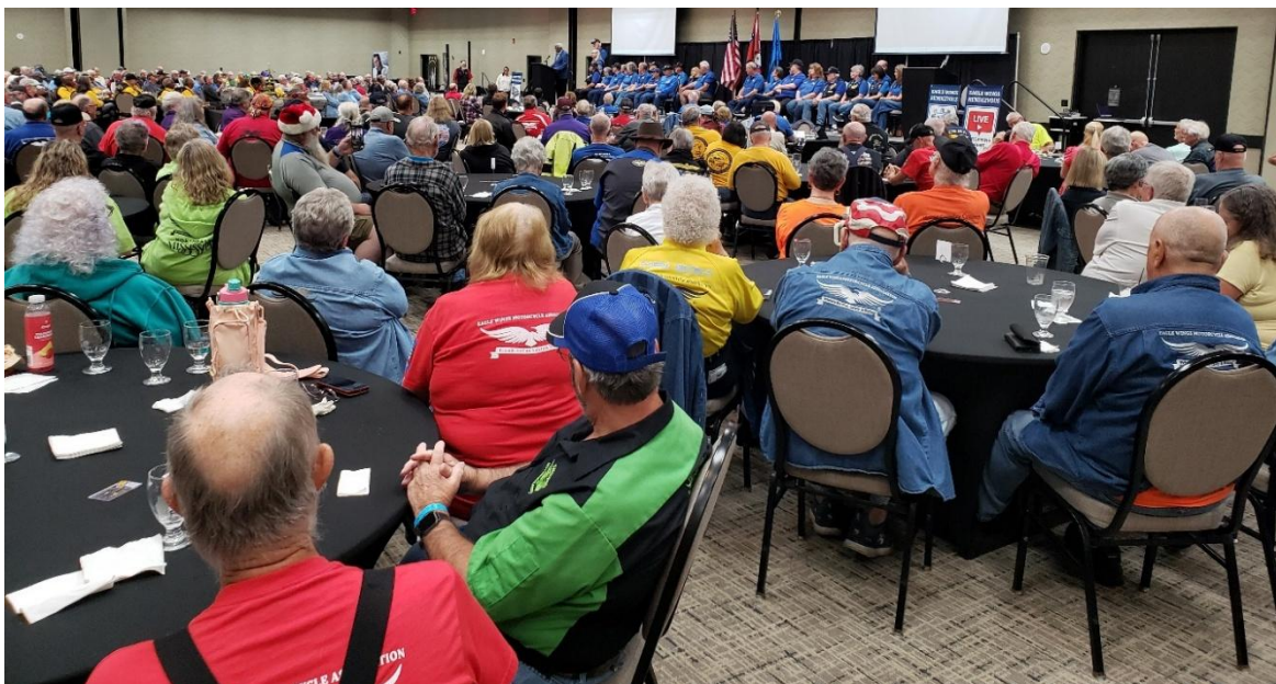
RENDEZVOUS OPENING CEREMONY - THURSDAY, AUGUST 28TH