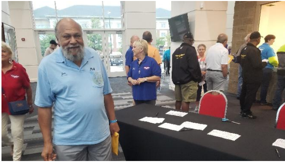
FL2-O working on-site registration