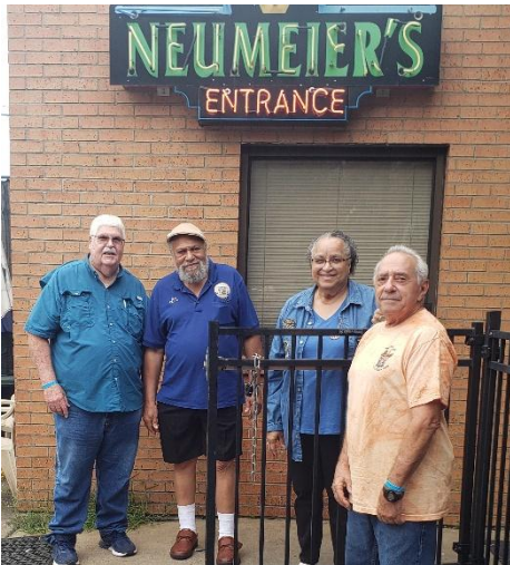
Neumeier's Rib Room – a local favorite