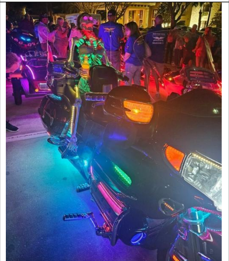
Friday Night Lighted Bike Show