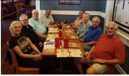
Wednesday Night at Hotel