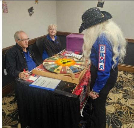
FL2-O had 10 working the Games Friday Morning. Way to Go!!!