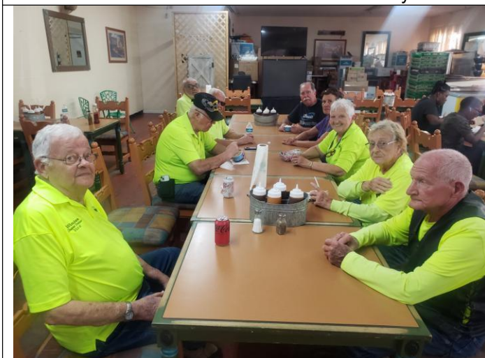
Ice-cream break at Smokin' Joe's in Bowling Green