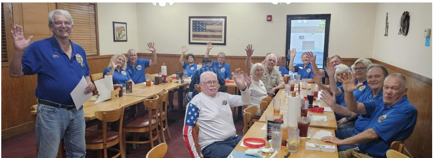
FL2-O had 16 out for their March Gathering - 8 had already left for the FL District Gathering of Friends