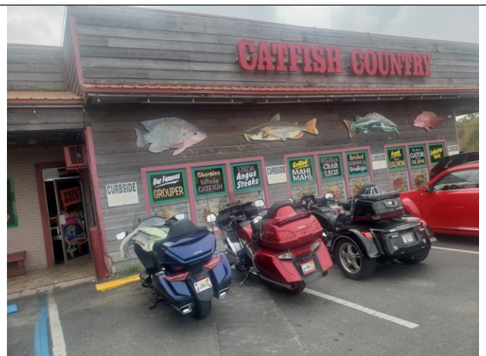
Wings looking for some food!