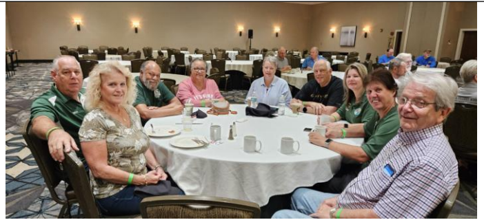
FL2-O Enjoying Saturday Breakfast