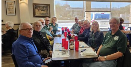
Catfish Place - Lunch