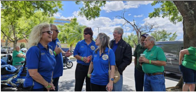
FL2-O watching Metalflake - Bike Games