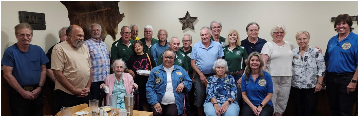
FL2-O Treasure Coast Riders - 22 Members Present