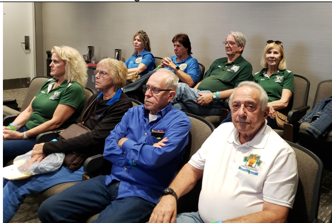
FL2-O updating Team Riding &amp; Mountain Riding