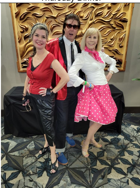
Costume Contest - FL2-O