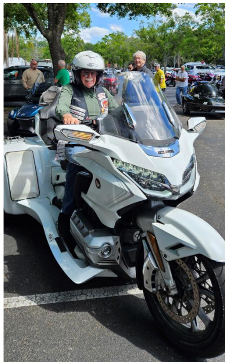
Bike Games - Metalflake