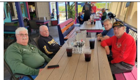
FL2-O Rides ← FL2-O enjoying Archie's