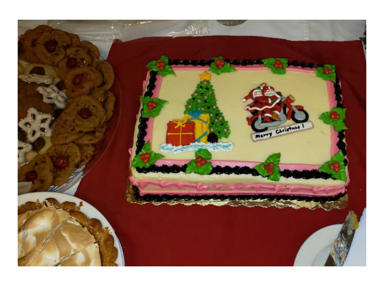
There were some big winners and some big losers in the cellophane ball game! Everyone loved the scrumptious dessert buffet!