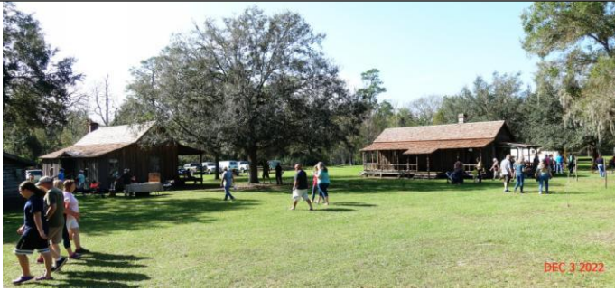
Trees &amp; Grounds