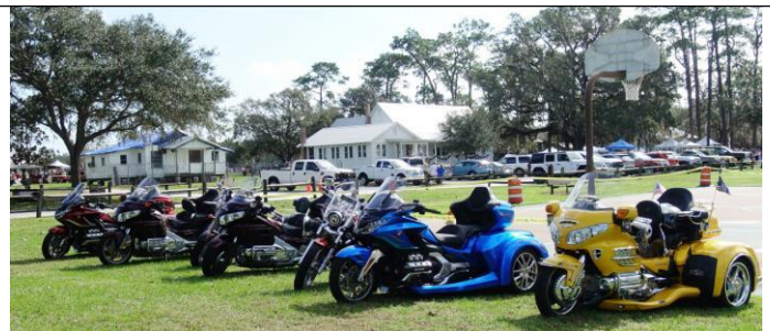
FL2-O Fort Christmas Ride Nine Riders