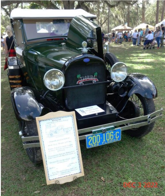
Model A Ford