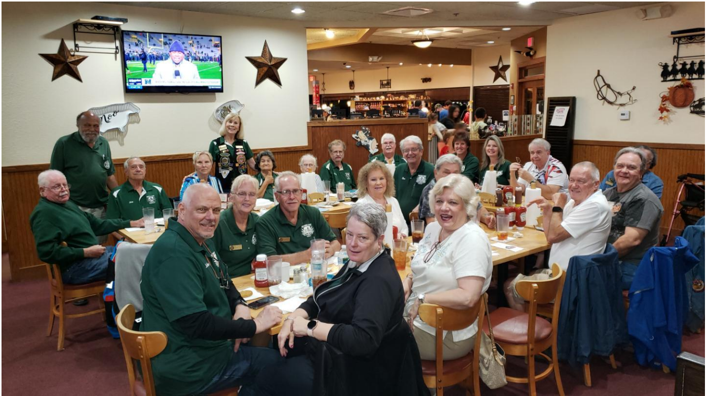
FL2-O Members at November Gathering