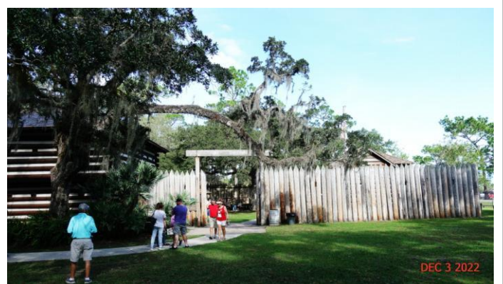
The Fort at Christmas, FL