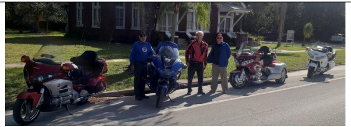
Marsh Landing Ride Saturday, November 19, 2022