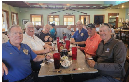
Six out for FUN!

After lunch we rode through Fort Pierce to 25 th street, Airoso Blvd and Citrus Blvd back to Stuart. My Rebel traveled 107 miles.