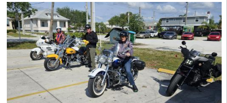
Bikes at Captains Gallery