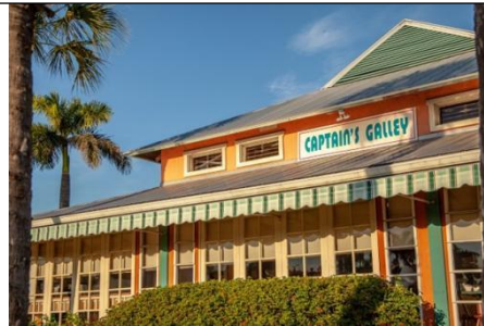
Captains Gallery - Ft. Piece