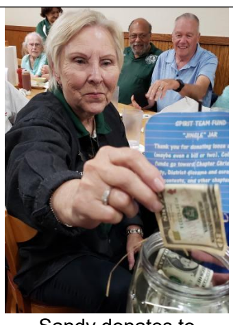
Sandy donates to Jingle Jar