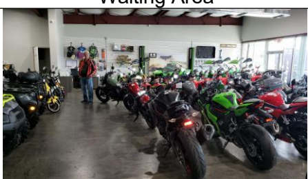
Showroom - Motorcycles

Treasure Coast Honda Kawasaki 3804 US-1 Fort Pierce, FL 34982