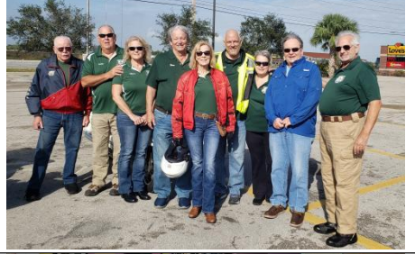
Ice-cream at Joy's