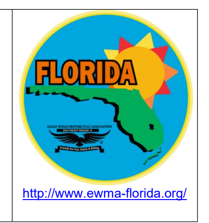
2023 Events - More Information may be found on the FL District web-page at: http://www.ewma-florida.org