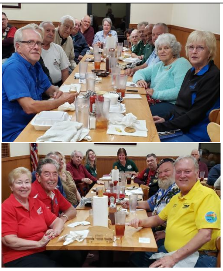
EWMA Members having FUN