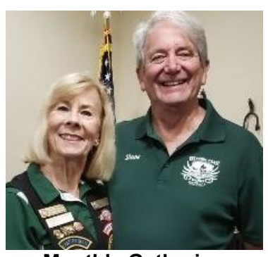
Monthly Gathering Every 2<sup>nd</sup> Wednesday at Southern Pig & Cattle Restaurant 2583 SE Federal Highway Stuart, FL

Dinner 5:00 Meet 6:00 with two break out sessions