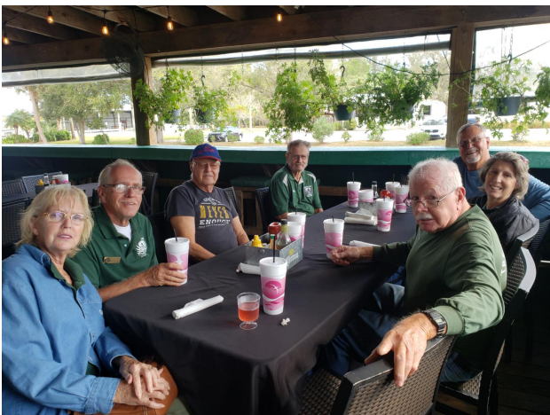
Tiki Bar in Clewiston