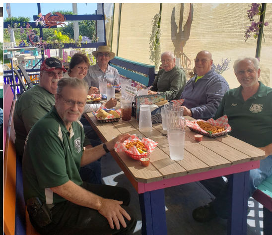
Archie's Seabreeze in Fort