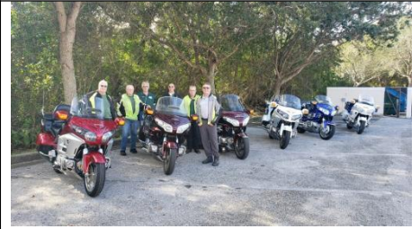
Archie's Seabreeze Fort Pierce Jan. 20