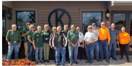
FL2-O & FL2-A at OK Corral Feb.23