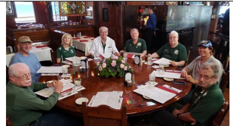
The Round Table at the Ocean Grill