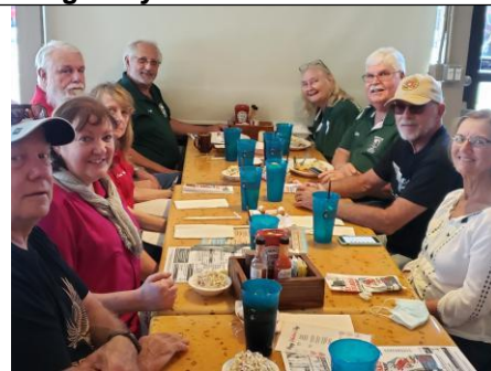
Dixie Cross Roads Multi-Chapter