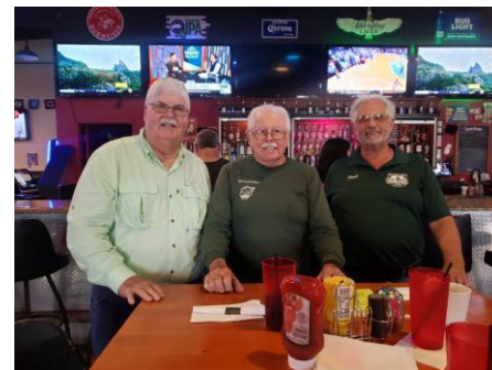
Tabby's in Lake Placid March 31