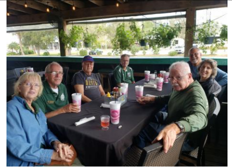
Clewiston Tiki Bar - Jan. 5