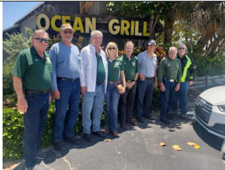
Ocean Grill May 5