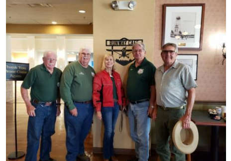
Runway Cafe Sebring April 20