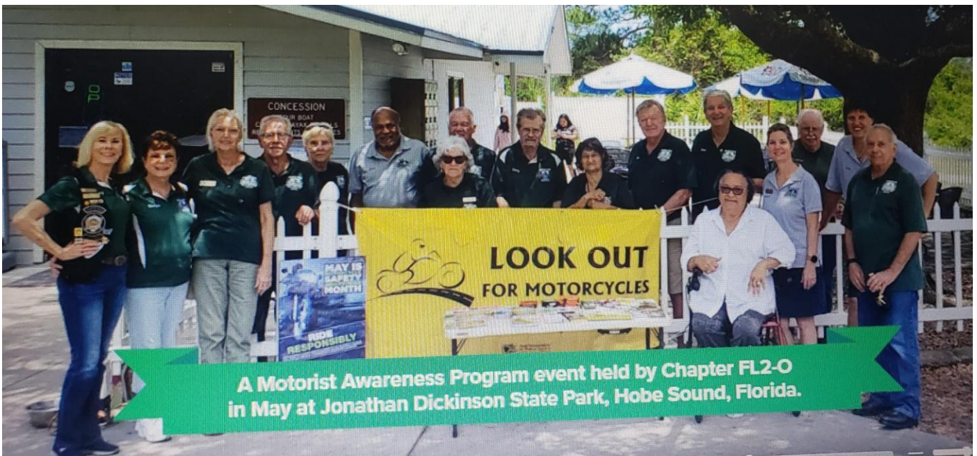
FL2-O Spirit Team Picnic at Johnathan Dickerson State Park - May 14, 2022