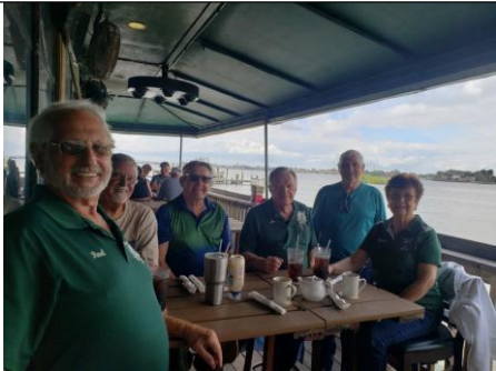
Riverside Cafe March 3