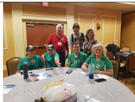
SC Rally - FL2-O & FL1-D