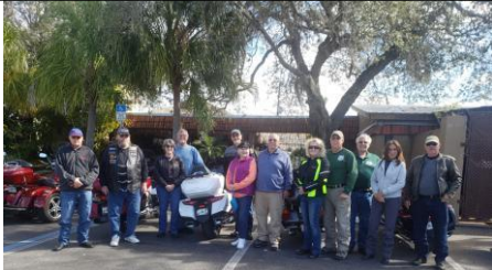
Cowpokes Sebring Feb. 2