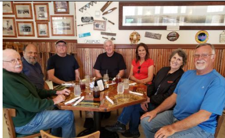
Marsh Landing Jan. 27