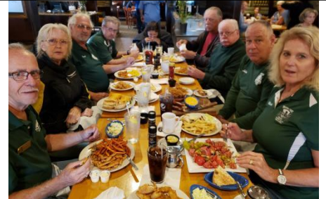
Olympic Diner Feb. 19