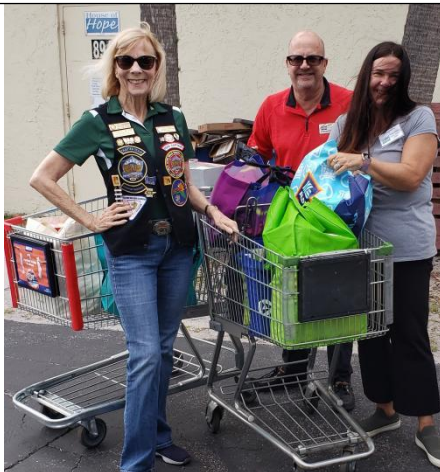
House of Hope - Donations