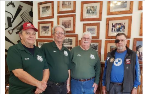
Marsh Landing Nov. 19