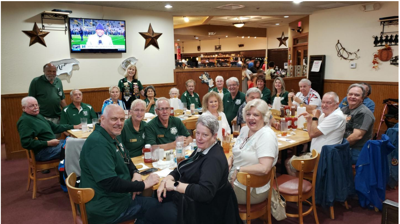
FL2-O Members at November Gathering