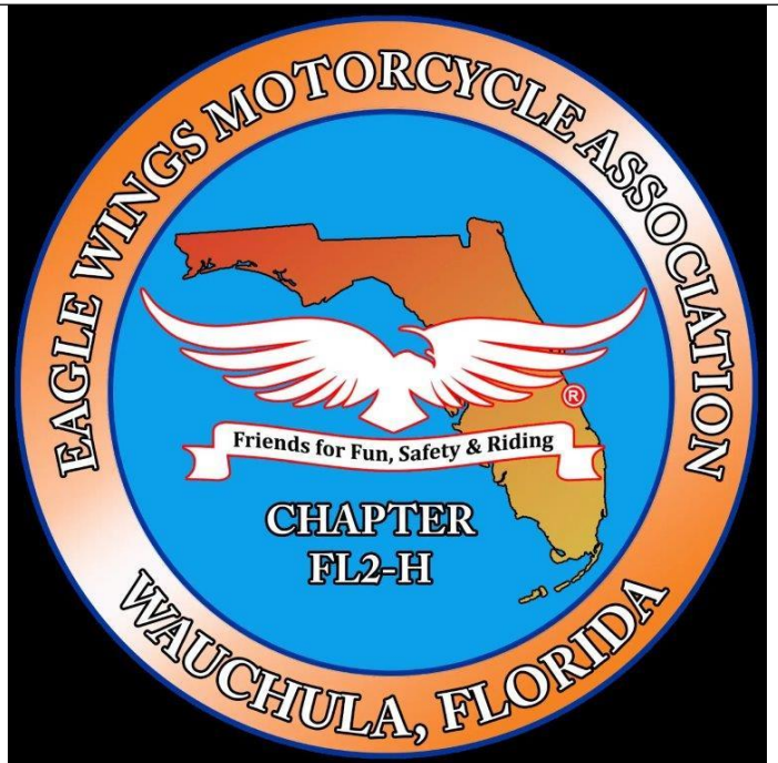
FL2-H new logo - Nice