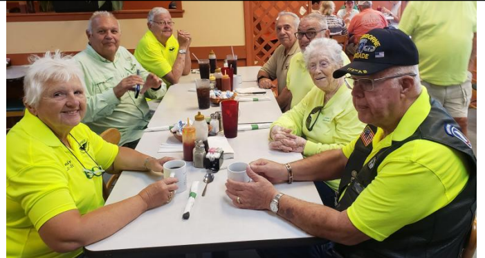
FL2-H Wauchula had six out